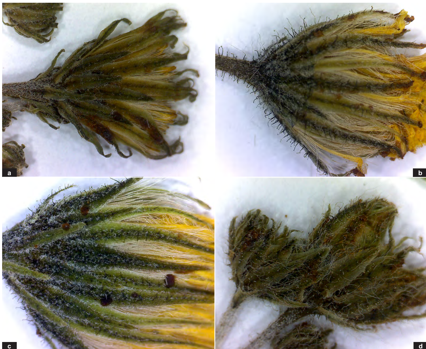
Fig. 20: capitula: a: H. pseudosparsum subsp. elatianum , b: H. retyezatense subsp. macilentoides , c: H. retyezatense subsp. vrontousense , d: H. transiens subsp. excentricum .