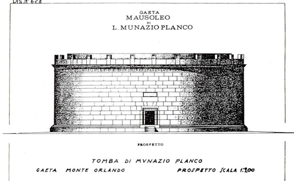
Fig. 1 - The Mausoleum of Munatius Plancus.