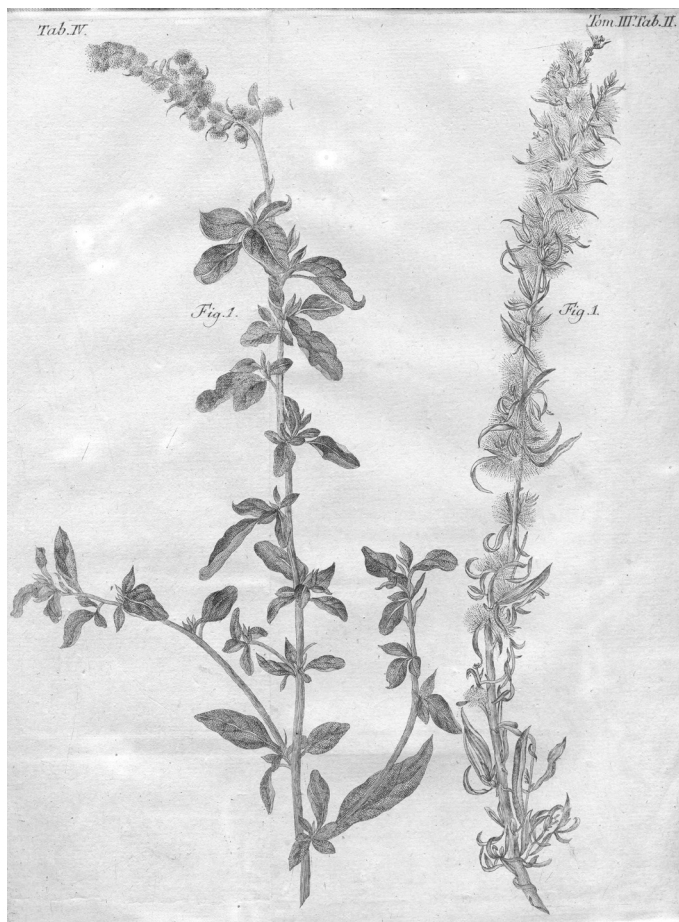
Fig. 1: The first drawing of Krascheninnikovia ceratoides in the Flora Sibirica , Tomus III. 1768, Tabula II, Figura I (plant right). The plant left: Axyris hybrida , Tabula IV, Figura 1.

The monotypic genus Ceratospermum of PERSOON (1807) is valued as just the same. Persoon arranged Axyris ceratoides and Diotis [without epithet] in the synonymy of Ceratospermum papposum Pers. He took over unchanged the three annual species of Axyris from Linné. Persoon left this Axyris ssp. among the “Monoecia Triandria,” but he arranged Ceratospermum papposum to the “Monoecia Tetrandria.”