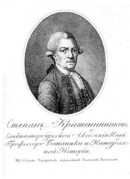
Fig. 3 (right): Portrait of Stepan Krascheninnikov (1711–1755). Copperplate. St. Petersburg, Archives of Academy of sciences in HINTZSCHE & NICKOL (1996).