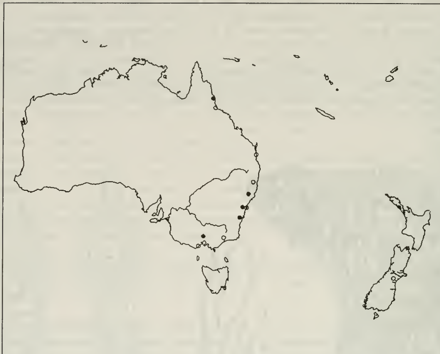
Fig. 2: The distribution of Sagediopsis dissimilis .