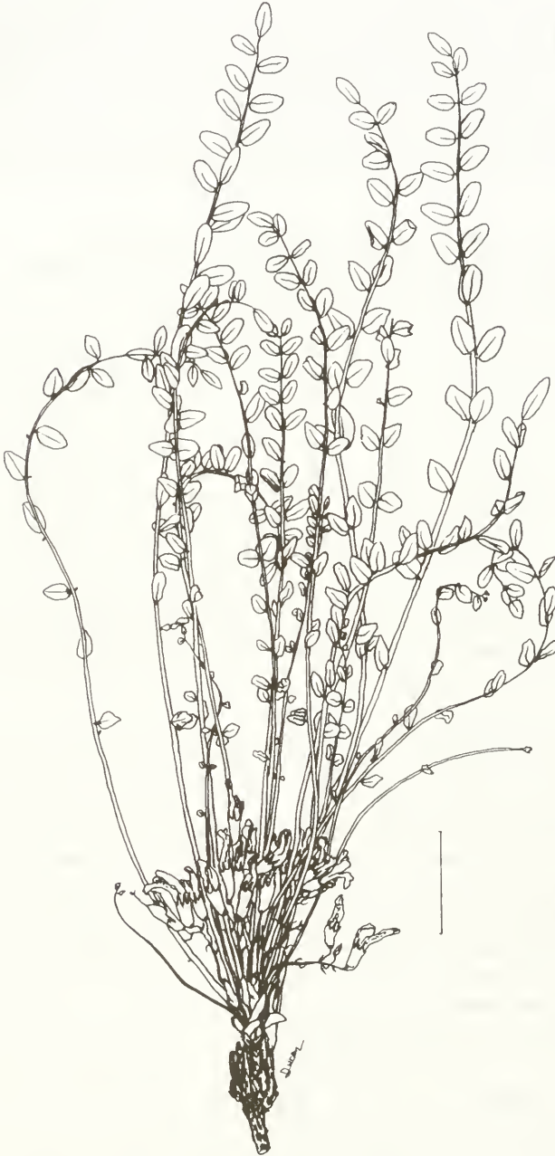
Fig. 1: Habit of Astragalus antalyensis (holotype). Scale bar: 3 cm.

In habit, bareness and the pilose style below the stigma near to A. aegobromus Boiss. & Hohen., but differing strongly by the stipules not connate one to another, the whitish, narrow bracts and the laterally compressed, thin-walled fruits.