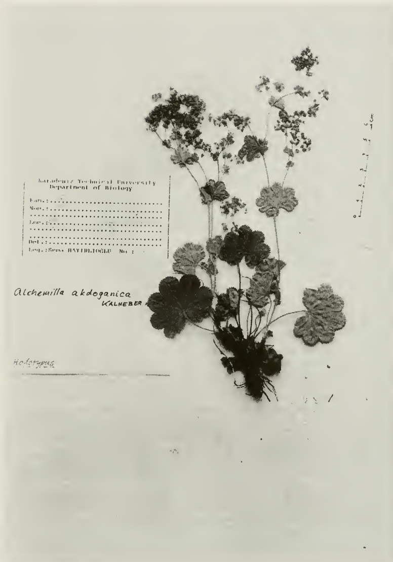
Alchemilla akdoganica Kalheber, holotype