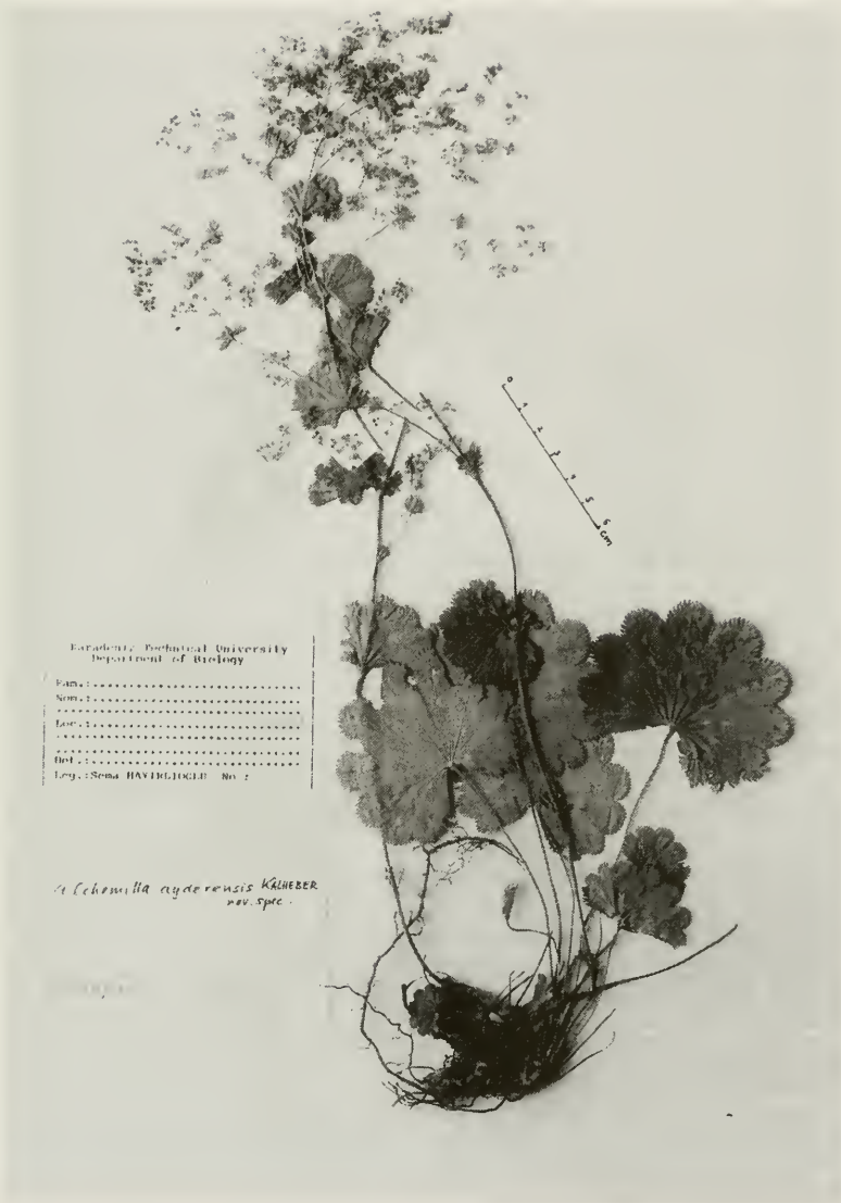
Alchemilla ayderensis Kalheber, holotype