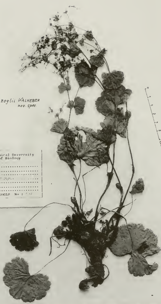
Alchemilla beyazoglu Kalheber, holotype