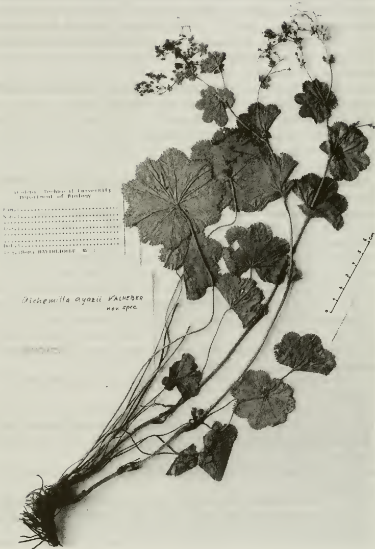
Alchemilla ayazii Kalheber, holotype