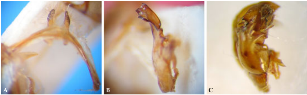
Fig. 2. Genitalia of male Eufriesea heideri spec. nov. A. Sternum 7. B. Sternum 8. C. Genital capsule.

mens. The holotype (male) is currently deposited at UFMG, the only paratype is housed at the ZSM. Terga and sterna are referred to as T1, T2, T3, etc., and S1, S2, S3, etc. Integument and setae coloration were described by eye using a Leica MZ12 microscope. Measurements were taken from the holotype, except of the S7 and the genitalia which were taken from the only paratype (in order to keep the holotype intact). The tongue length was measured following Kimsey (1982: 10), which is “the length of the basal two segments of the labial palpi, from the basal fold, normally resting behind the mandibles, to the two apical segments of the labial palpi”.