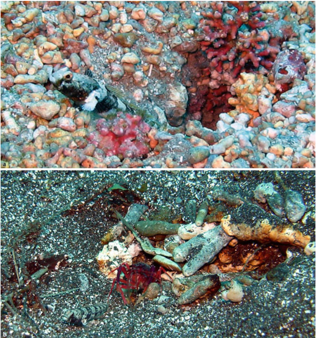
Fig. 3. Didogobius wirtzi spec. nov. (A), and D. amicuscaridis spec. nov. (B) resting at the entrance of the axiid shrimp burrow (shrimp visible in B). Note the white dorsal head band and porcelain colored pectoral fin bases.

(3 to 6) straight vertical with pale bars in between uninterrupted from dorsal to lateral midline; (8) in preserved specimens basal part of pectoral fin base and of pectoral fin membrane whitish vs. pectoral fin base pigmented, with dark dot in upper part.