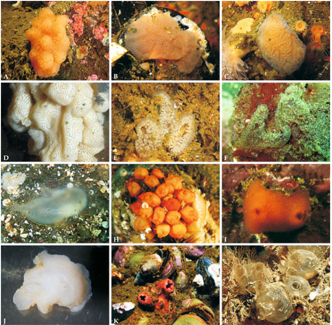
Fig. 2. Ascidians collected at Comau fjord. A. Aplidium fuegiense ( \times 0,3 ); B. Aplidium magellanicum (natural size); C. Aplidium variabile ( \times 0,5 ); D. Didemnum studei ( \times 0,5 ); E. Lissoclinum aff. caulleryi (natural size); F. Distaplia colligans (natural size); G. Corella eumyota ( \times 0,5 ); H. Alloecarpa incrustans ( \times 1,3 ); I. Cnemidocarpa nordenskjoldi ( \times 2 ); J. Pyura sp. ( \times 3 ); K. Pyura chilensis ( \times 0,5 ); L. Paramolgula gregaria ( \times 0,5 ). All pictures were taken underwater except J (specimen fixed).