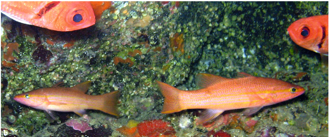
Fig. 2. Liopropoma emanueli spec. nov. in the natural habitat, near Tarrafal, Santiago Island. a. in small cave at 18 m depth; b. in small cave at 32 m depth (with soldierfish Myripristis jacobus Cuvier, 1829). The animal on the right is the paratype (ZSM 41222, 101.8 mm SL).

Kon, T., Yoshino, T. & Sakurai, Y. 1999. Liopropoma dorsoluteum sp. nov., a new serranid fish from Okinawa, Japan. Ichthyological Research 46(1): 67–71.