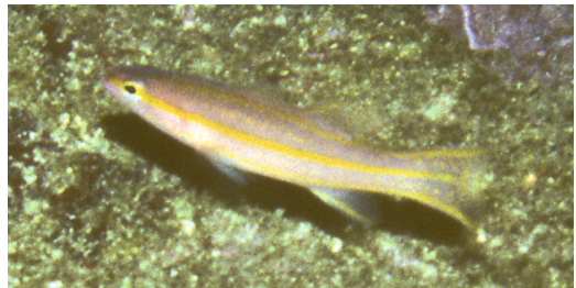
Fig. 3. Liopropoma spec. from 45 m depth at Pedra da Galé, north coast of Príncipe Island, Republic of São Tomé and Príncipe.