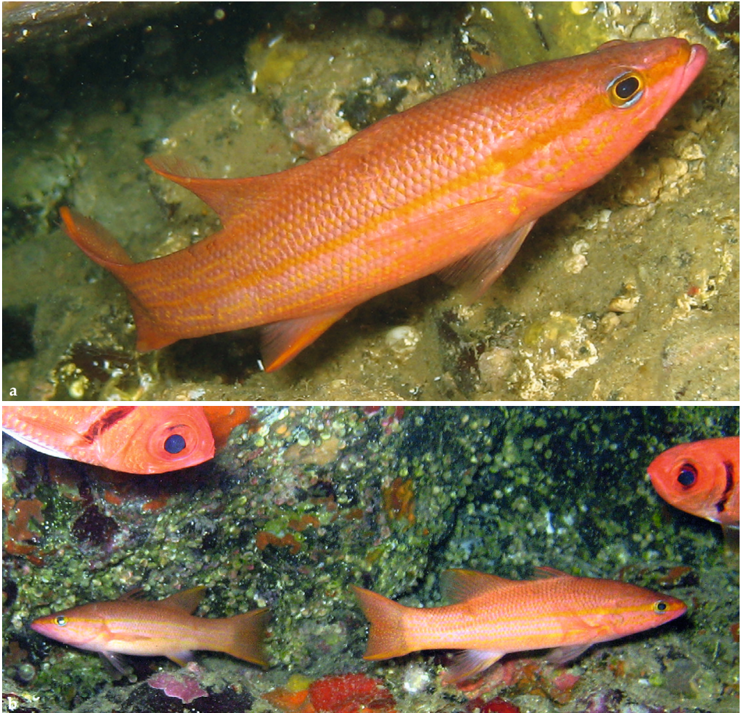
Fig. 2. Liopropoma emanueli spec. nov. in the natural habitat, near Tarrafal, Santiago Island. a. in small cave at 18 m depth; b. in small cave at 32 m depth (with soldierfish Myripristis jacobus Cuvier, 1829). The animal on the right is the paratype (ZSM 41222, 101.8 mm SL).