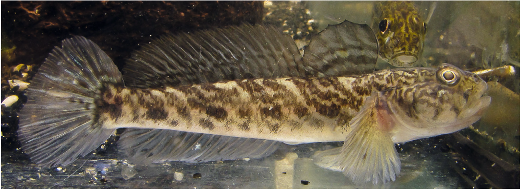
Fig. 2. Babka gymnotrachelus (ZSM 41739), photographed shortly after collection.