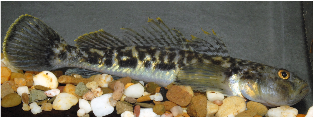
Fig. 3. Neogobius fluviatilis (ZSM 41740), photographed shortly after collection.