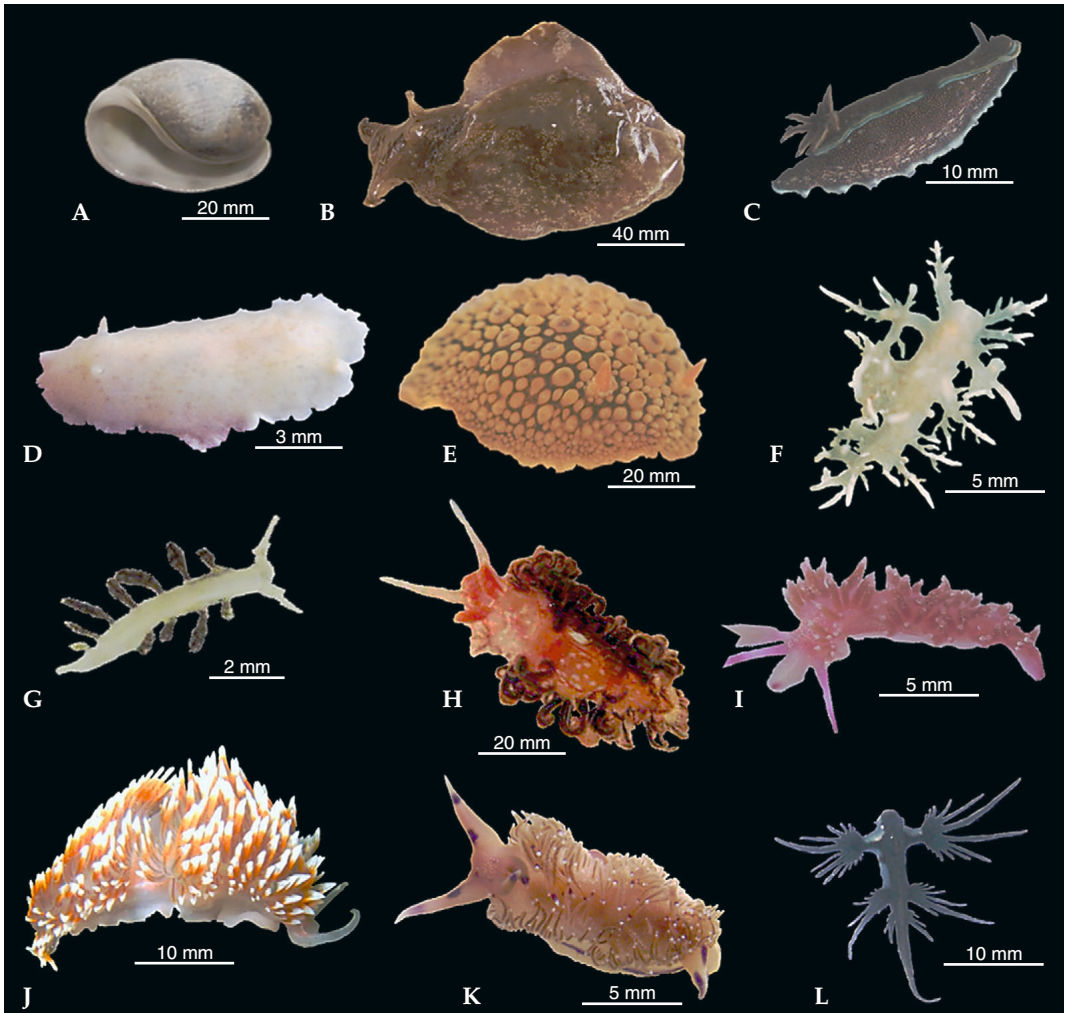
Fig. 3. Examples of species found in some of the new localities. A. Bulla punctulata ; B. Aplysia juliana ; C. Felimare agassizii ; D. Baptodoris peruviana ; E. Doris fontainei ; F. Dendronotus cf. venustus ; G. Doto uva ; H. Spurilla cf. neapolitana ; I. Bajaecolis bertschi ; J. Phidiana lottini ; K. Flabellina cynara ; L. Glaucus atlanticus .