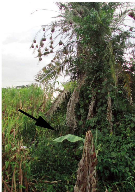
Fig. 1. Habitat view of the type locality of L. fascipilosa sp. nov.