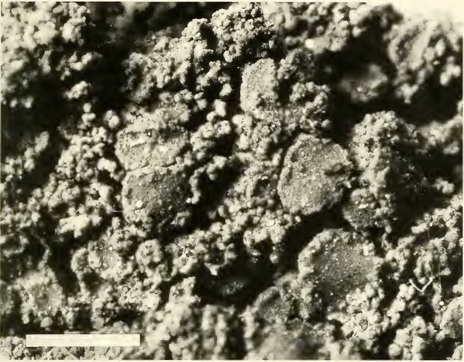
Fig. 1. Candelariella viae-lacteae (STU-Wirth 17669, Greece: Athen). — Scale: 1 mm.

Pinus sp. there are no other lichens; the specimen on the deciduous tree is accompanied by Buellia alboatra , Lecanora hagenii , Physcia biziana , Physconia grisea s. lat. and Xanthoria parietina .