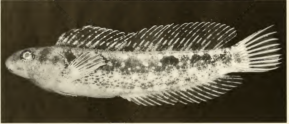
Fig. 1. Petroscirtes ancylodon , male, total length 132.0 mm, Red Sea, Gulf of Eilat.

An extraordinarily large specimen of Petroscirtes ancylodon was collected by the junior author in the northern Red Sea at a very unusual depth of 67 m. This specimen is described in the present paper; remarks on the depth distribution of blennioid fishes are added.