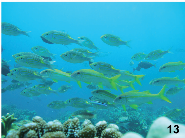
Figs. 8–13. Shore fishes of Europa Island. – 8. Epinephelus tukula ; photograph by P. DURVILLE, April 2011. 9. Priacanthus hamrur ; photograph by P. DURVILLE, April 2011. 10. Caranx melampygus ; photograph by E. BRETAGNE, Oct. 2011. 11. Gerres longirostris ; photograph by P. BORSA, 7 April 2011. 12. Monotaxis grandoculis ; photograph by P. BORSA, 5 April 2011. 13. Mulloidichthys vanicolensis (foreground) and Gnathodentex aureolineatus (background); also includes Labroides dimidiatus and Gomphosus caeruleus (below), and Naso elegans (background right); photograph by P. DURVILLE, April 2011.