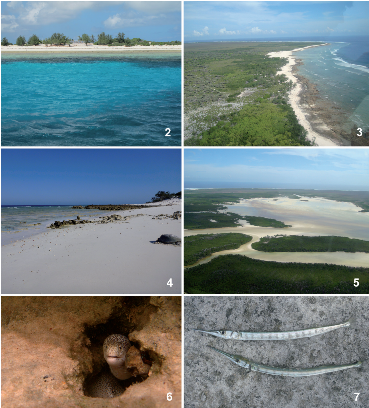
Figs. 2–7. Europa Island (2–6) and shore fishes from this island (7, 8). – 2. North coast with Gendarmerie building; photograph by P. BORSA, April 2011. 3. West coast; aerial photograph by P. BORSA, April 2011. 4. West coast; photograph by R. FRICKE, 9 Nov. 2011. 5. Inner lagoon; aerial photograph by P. BORSA, April 2011. 6. Gymnothorax pictus ; photograph by P. BORSA, 7 April 2011. 7. Strongylura leiura ; photograph by P. BORSA, 7 April 2011.

land as Caracanthus zeylonicus by FOURMANOIR (1952: 187); record confirmed by P. DURVILLE et al. during the expedition MD-11.