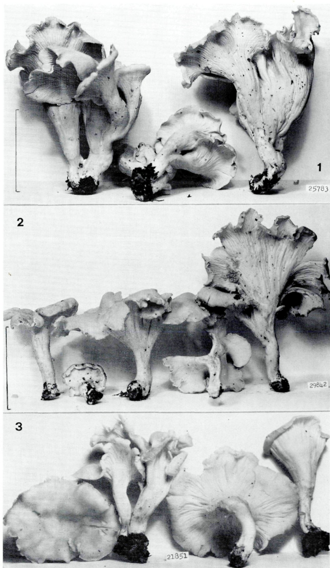
Fig. 1. Cantharellus confluens . TENN 25783. Standard line = 3 cm. Fig. 2, 3. Cantharellus lateritius . 2. TENN no. 29842. Note hymenial surface as irregular folds. 3. TENN no. 21851. Note hymenial surface as depressed pleats. Standard line = 3 cm.