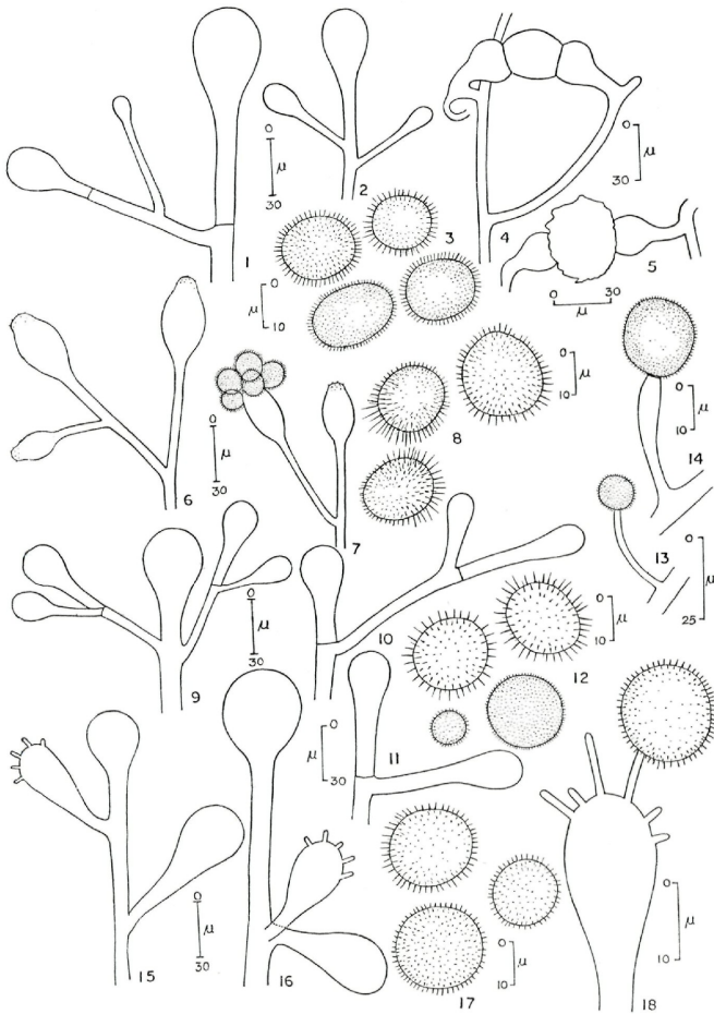
Plate 1: Cunninghamella homothallica KOMINAMI & TUBAKI: 1-2. Upper portions of conidiophores showing the pattern of branching. - 3. Conidia. - 4. Immature zygospore. - 5. Fully developed zygospore. - C. vesiculosa MISRA: 6-7. Two conidiophores showing branching pattern. - 8. Conidia. - C. echinulata (THAXTER) THAXTER: 9-11. Upper portions of conidiophores. - 12. Conidia. - 13-14. Short conidiophores arising from aerial hyphae bearing single conidia at their tips. - C. echinulata var. indica var. nov.: 15-16. Upper portions of branched conidiophores. - 17. Conidia. - 18. Vesicle (enlarged) showing the long sterigmata