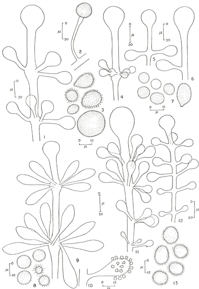
Plate 2: Cunninghamella bainieri NAUMOV: 1. Upper portion of verticillately branched conidiophore. — 2. A short lateral branch with a very short vesicle and a giant conidium. — 3. Giant and normal conidia. — C. blakesleecana LENDNER: 4–6. Upper portions of conidiophores showing the pattern of branching. — 7. Conidia. — C. indica sp. nov.: 8. Conidia. — 9. Upper portion of branched conidiophore showing clavate secondary vesicles. — 10. A secondary vesicle enlarged with young conidia. — C. blakesleecana var. verticillata (PAINE) comb. nov.: 11–12. Upper portions of branched conidiophores. — 13. Conidia