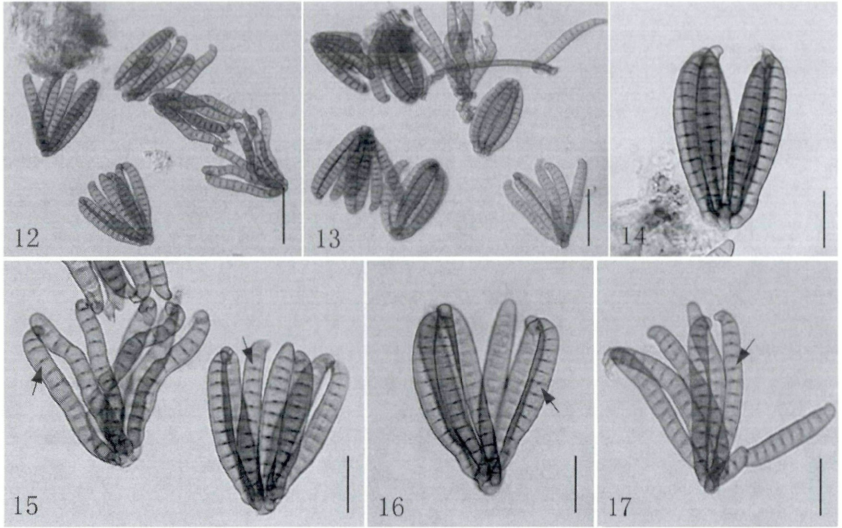
Figs. 12–17. Interference contrast micrographs of Digitodesmium heptasporum (from holotype). – 12, 13. Squash mount of sporodochium with conidia. – 14–17. Conidia. Note the conspicuous septal pores (small arrows) – Bars: 12, 13 = 40 \mu\text{m} ; 14–17 = 20 \mu\text{m} .

Sporodochia on natural substratum 150–300 \mu\text{m} diam, punctiform, scattered, grey to dark brown, granular. Mycelium mostly immersed, composed of brown, smooth, thin-walled, septate, branched hyphae. – Conidiophores semi-macronematous, mononematous, pale brown, smooth, thin-walled, unbranched, cylindrical, short, flexuous, deteriorating at conidial maturity. Conidiogenous cells monoblastic, integrated, pale brown, smooth, thin-walled, cylindrical, terminal, determinate. Conidial secession schizolytic. – Conidia 50–75 \times 32.5–70 \mu\text{m} ( \bar{x} = 61 \times 50.5 \mu\text{m} , n = 25), cheiroid, cell rows arranged in several layers, pale brown, smooth, euseptate, holoblastic, solitary, consisting of 70–110 cells arranged in (6)–7 rows. Rows mostly separating at the apex, united by a 5–6.5 \mu\text{m} wide, pale brown, cubical, truncate basal cell. Each row of cells 47–67.5 \times 7–8.7 \mu\text{m} , consisting of 11–17 cells, discrete, unbranched, cylindrical, with conspicuous pores in the septa (Figs. 14–17), apical cells narrower than middle cells and mostly recurved, conidial appendages absent (Figs. 14–17).