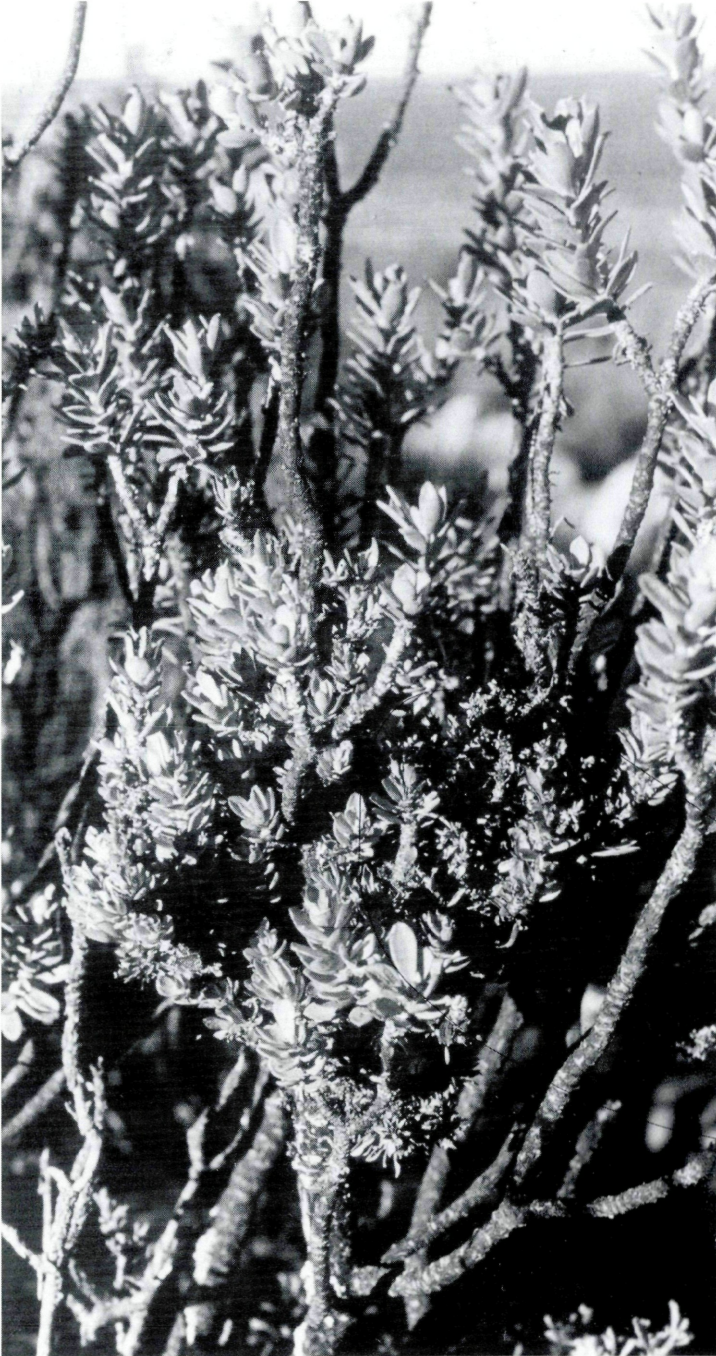
Fig. 1. Witches' broom caused by Uromyces euryopsidicola on Euryops empetrifolius .