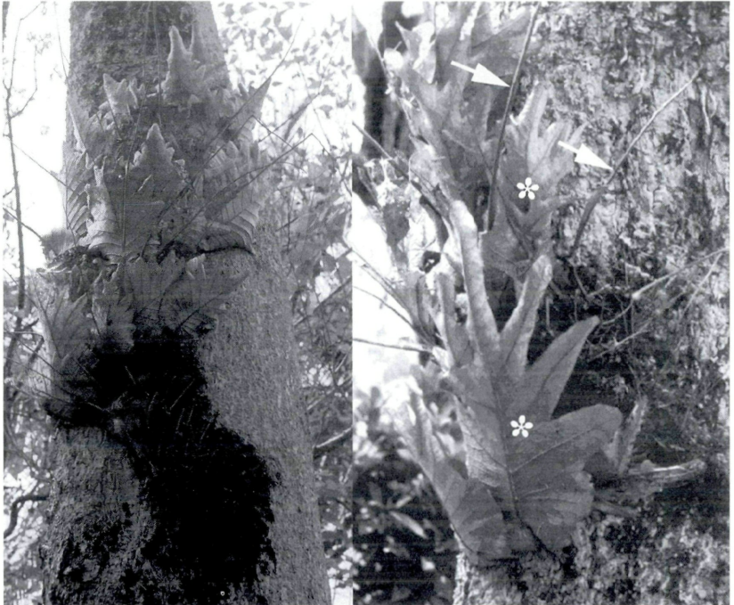
Fig. 1. The epiphytic fern Drynaria quersifolia on the riparian tree trunks of Konaje stream showing prominent bracket leaves (stars) and remnants of rachis of nest leaves (arrows) attached to rhizomes (photographed on February 24, 2006).

J. Sm. (Polypodiaceae), commonly known as “oak-leaf basket fern” is a widely distributed pteridophyte of forests of the Western Ghats and west coast of India (Fig. 1). This fern produces two kinds of leaves: nest leaves (slender, fragile, short-lived, turn brown on senescence shed on drying) and bracket leaves (plate-like, resembling oak leaves, tough, leathery, remain attached to creeping rhizome after senescence, decay as standing dead). The bracket leaves function as funnels to trap debris mainly from canopy water run-off.