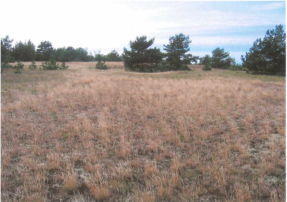
Fig. 3: Corniculario aculeatae-Corynephorum canescens in Pāvilosta.

burned, creating mobile sand areas without vegetation. However, the former land use has drastically decreased during the last 20–30 years. Many grey dunes have been overgrown with pine trees, shrubs or dense Calamagrostis epigeios stands, and only some sandy patches or belts on pathways develop periodically. As wind is a significant factor even for grey dunes, and considering that the dunes of Pāvilosta are situated towards the sea, the ecological preconditions are more or less favourable for the Corynephorus canescens habitat development. The Corniculario-Corynephorum typically colonises weakly acid to neutral soil without a humus layer or with a very thin one. A limiting factor for plants is the shingle-sandy soil substrate, which is easily leached.