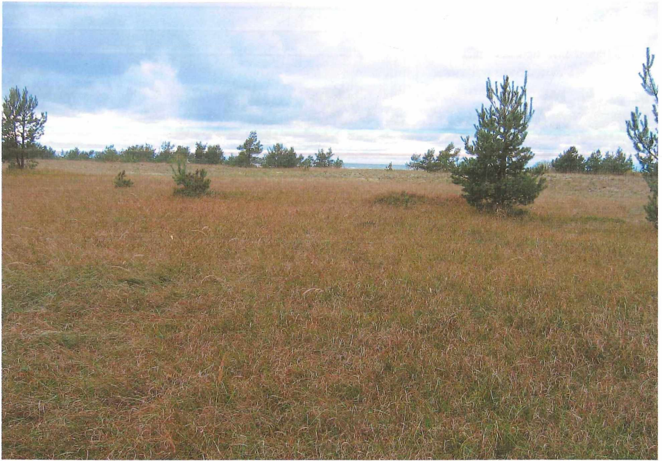
Fig. 4: Caricetum arenariae in Pāvilosta.

Stands of the Caricetum arenariae with dense vegetation mostly occur in depressions and on leeward slopes. These sites are relatively humid, eutrophic and protected by dunes from sea wind and sand drift. Often, Caricetum arenariae is like a contact community between mesophytic grasslands and the Festucetum polesicae or even primary dunes with Leymus arenarius . The main localities of the older successional stages Caricetum arenariae are the widest dune areas of, e.g., Nida-Pape, Ziemupe, Pāvilosta and Rīga. These dunes were formerly grazed or cut, but during the last 20 years this land use has nearly stopped.