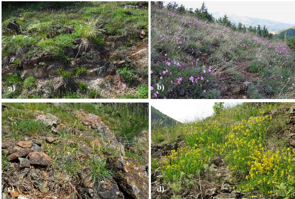
Fig. 2. Steppe-like vegetation on shallow ultramafic soils in the Balkans included in the order Halacsyetalia sendtneri. a) Stand of a Festuco ovinae-Euphorbietum glabriflorae ( Potentillion visianii) in the Mt Zlatibor Mountain, Serbia. Visible are Artemisia alba, Euphorbia glabriflora, Halacsya sendtneri and Stipa gr. pulcherrima. b) Stand of a Cynancho vincetoxici-Saponarietum intermediae ( Centaureo kosaninii-Bromion fibrosi) in the Mt Šarplanina Mountain, Brezovica, Gradište, Kosovo. Visible are Festuca gr. valesiaca and Saponaria sicula subsp. intermedia. c) Stand of a Poo alpinae-Plantaginetum holostei (“ Thymion jankae ”) in the Mt Tara Mountain, Kremna, Serbia. Visible are Plantago holosteum, Poa badensis gr. and Thymus jankae. d) Stand of a Stipetum novakii ( Potentillion visianii) in the Brđani-Schlucht, Serbia. Visible are Halacsya sendtneri, Stipa novakii and Artemisia alba sowie Gebüsche aus Quercus cerris und Fraxinus ornus.

Abb. 2. Steppenrasen der Ordnung Halacsyetalia sendtneri auf flachgründig-ultramafischen Böden auf dem Balkan. a) Bestand eines Festuco ovinae-Euphorbietum glabriflorae ( Potentillion visianii) am Mt Zlatibor, Serbien mit Artemisia alba, Euphorbia glabriflora, Halacsya sendtneri und Stipa gr. pulcherrima (Foto: N. Kuzmanović, 12.06.2015). b) Bestand eines Cynancho vincetoxici-Saponarietum intermediae ( Centaureo kosaninii-Bromion fibrosi) am Mt Šarplanina, Brezovica, Gradište, Kosovo, mit Festuca gr. valesiaca, Saponaria sicula subsp. intermedia (Foto: M. Lazarević, 11. 08.2014). c) Bestand eines Poo alpinae-Plantaginetum holostei (“ Thymion jankae ”) am Mt Tara, Kremna, Serbien, mit Plantago holosteum, Poa badensis gr. und Thymus jankae (Foto: N. Kuzmanović, 10.06.2015). d) Bestand eines Stipetum novakii ( Potentillion visianii) in der Brđani-Schlucht in Serbien mit blühende Halacsya sendtneri (nach den österreichischen bzw. deutschen Botanikern Eugen von Halácsy und Otto Sendtner), Stipa novakii und Artemisia alba sowie Gebüsche aus Quercus cerris und Fraxinus ornus.