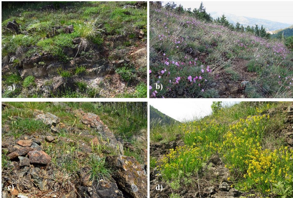
Fig. 2. Steppe-like vegetation on shallow ultramafic soils in the Balkans included in the order Halacsyetalia sendtneri. a) Stand of a Festuco ovinae-Euphorbietum glabriflorae ( Potentillion visianii) in the Mt Zlatibor Mountain, Serbia. Visible are Artemisia alba, Euphorbia glabriflora, Halacsya sendtneri and Stipa gr. pulcherrima. b) Stand of a Cynancho vincetoxici-Saponarietum intermediae ( Centaureo kosaninii-Bromion fibrosi) in the Mt Šarplanina Mountain, Brezovica, Gradište, Kosovo. Visible are Festuca gr. valesiaca and Saponaria sicula subsp. intermedia. c) Stand of a Poo alpinae-Plantaginetum holostei (“ Thymion jankae ”) in the Mt Tara Mountain, Kremna, Serbia. Visible are Plantago holostium, Poa badensis gr. and Thymus jankae. d) Stand of a Stipetum novakii ( Potentillion visianii) in the Brđani-Schlucht, Serbia. Visible are Halacsya sendtneri, Stipa novakii und Artemisia alba sowie Gebüsche aus Quercus cerris und Fraxinus ornus.

Abb. 2. Steppenrasen der Ordnung Halacsyetalia sendtneri auf flachgründig-ultramafischen Böden auf dem Balkan. a) Bestand eines Festuco ovinae-Euphorbietum glabriflorae ( Potentillion visianii) am Mt Zlatibor, Serbien mit Artemisia alba, Euphorbia glabriflora, Halacsya sendtneri und Stipa gr. pulcherrima. b) Bestand eines Cynancho vincetoxici-Saponarietum intermediae ( Centaureo kosaninii-Bromion fibrosi) am Mt Šarplanina, Brezovica, Gradište, Kosovo, mit Festuca gr. valesiaca, Saponaria sicula subsp. intermedia. c) Bestand eines Poo alpinae-Plantaginetum holostei (“ Thymion jankae ”) am Mt Tara, Kremna, Serbien, mit Plantago holostium, Poa badensis gr. und Thymus jankae. d) Bestand eines Stipetum novakii ( Potentillion visianii) in der Brđani-Schlucht in Serbien mit blühende Halacsya sendtneri (nach den österreichischen bzw. deutschen Botanikern Eugen von Halácsy und Otto Sendtner), Stipa novakii und Artemisia alba sowie Gebüsche aus Quercus cerris und Fraxinus ornus.