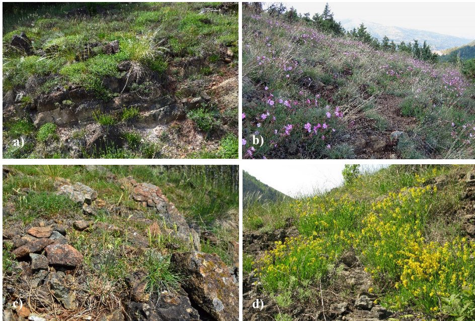
Fig. 2. Steppe-like vegetation on shallow ultramafic soils in the Balkans included in the order Halacsyetalia sendtneri. a) Stand of a Festuco ovinae-Euphorbietum glabriflorae ( Potentillion visianii) in the Mt Zlatibor Mountain, Serbia. Visible are Artemisia alba, Euphorbia glabriflora, Halacsya sendtneri and Stipa gr. pulcherrima. b) Stand of a Cynancho vincetoxici-Saponarietum intermediae ( Centaureo kosaninii-Bromion fibrosi) in the Mt Šarplanina Mountain, Brezovica, Gradište, Kosovo. Visible are Festuca gr. valesiaca and Saponaria sicula subsp. intermedia. c) Stand of a Poo alpinae-Plantaginetum holostei (“ Thymion jankae ”) in the Mt Tara Mountain, Kremna, Serbia. Visible are Plantago holostium, Poa badensis gr. and Thymus jankae. d) Stand of a Stipetum novakii ( Potentillion visianii) in the Brđani-Schlucht, Serbia. Visible are Halacsya sendtneri, Stipa novakii and Artemisia alba sowie Gebüsche aus Quercus cerris und Fraxinus ornus.

Abb. 2. Steppenrasen der Ordnung Halacsyetalia sendtneri auf flachgründig-ultramafischen Böden auf dem Balkan. a) Bestand eines Festuco ovinae-Euphorbietum glabriflorae ( Potentillion visianii) am Mt Zlatibor, Serbien mit Artemisia alba, Euphorbia glabriflora, Halacsya sendtneri und Stipa gr. pulcherrima. b) Bestand eines Cynancho vincetoxici-Saponarietum intermediae ( Centaureo kosaninii-Bromion fibrosi) am Mt Šarplanina, Brezovica, Gradište, Kosovo, mit Festuca gr. valesiaca, Saponaria sicula subsp. intermedia. c) Bestand eines Poo alpinae-Plantaginetum holostei (“ Thymion jankae ”) am Mt Tara, Kremna, Serbien, mit Plantago holostium, Poa badensis gr. und Thymus jankae. d) Bestand eines Stipetum novakii ( Potentillion visianii) in der Brđani-Schlucht in Serbien mit blühende Halacsya sendtneri (nach den österreichischen bzw. deutschen Botanikern Eugen von Halácsy und Otto Sendtner), Stipa novakii und Artemisia alba sowie Gebüsche aus Quercus cerris und Fraxinus ornus.