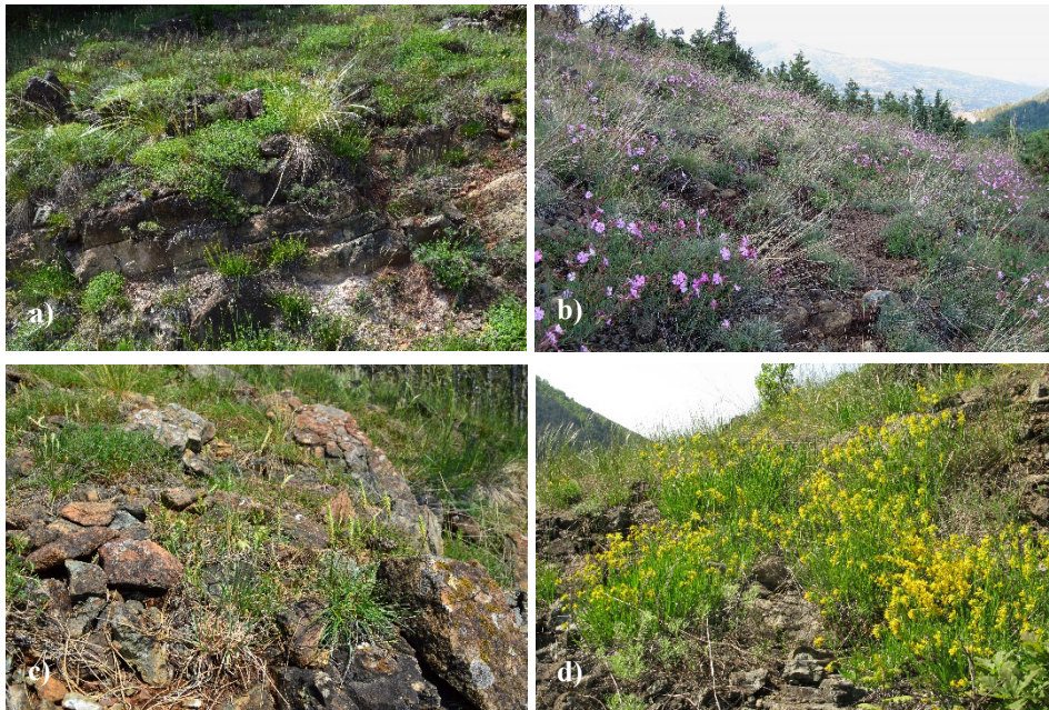
Fig. 2. Steppe-like vegetation on shallow ultramafic soils in the Balkans included in the order Halacsyetalia sendtneri. a) Stand of a Festuco ovinae-Euphorbietum glabriflorae ( Potentillion visianii) in the Mt Zlatibor Mountain, Serbia. Visible are Artemisia alba, Euphorbia glabriflora, Halacsysa sendtneri and Stipa gr. pulcherrima. b) Stand of a Cynancho vincetoxici-Saponarietum intermediae ( Centaureo kosaninii-Bromion fibrosi) in the Mt Šarplanina Mountain, Brezovica, Gradište, Kosovo. Visible are Festuca gr. valesiaca and Saponaria sicula subsp. intermedia. c) Stand of a Poo alpinae-Plantaginetum holostei (“ Thymion jankae ”) in the Mt Tara Mountain, Kremna, Serbia. Visible are Plantago holosteum, Poa badensis gr. and Thymus jankae. d) Stand of a Stipetum novakii ( Potentillion visianii) in the Brđani-Schlucht, Serbia. Visible are Halacsysa sendtneri, Stipa novakii and Artemisia alba sowie Gebüsch aus Quercus cerris und Fraxinus ornus.

Abb. 2. Steppenrasen der Ordnung Halacsyetalia sendtneri auf flachgründig-ultramafischen Böden auf dem Balkan. a) Bestand eines Festuco ovinae-Euphorbietum glabriflorae ( Potentillion visianii) am Mt Zlatibor, Serbien mit Artemisia alba, Euphorbia glabriflora, Halacsysa sendtneri und Stipa gr. pulcherrima (Foto: N. Kuzmanović, 12.06.2015). b) Bestand eines Cynancho vincetoxici-Saponarietum intermediae ( Centaureo kosaninii-Bromion fibrosi) am Mt Šarplanina, Brezovica, Gradište, Kosovo, mit Festuca gr. valesiaca, Saponaria sicula subsp. intermedia (Foto: M. Lazarević, 11. 08.2014). c) Bestand eines Poo alpinae-Plantaginetum holostei (“ Thymion jankae ”) am Mt Tara, Kremna, Serbien, mit Plantago holosteum, Poa badensis gr. und Thymus jankae (Foto: N. Kuzmanović, 10.06.2015). d) Bestand eines Stipetum novakii ( Potentillion visianii) in der Brđani-Schlucht in Serbien mit blühende Halacsysa sendtneri (nach den österreichischen bzw. deutschen Botanikern Eugen von Halácsy und Otto Sendtner), Stipa novakii und Artemisia alba sowie Gebüsch aus Quercus cerris und Fraxinus ornus.