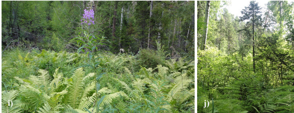
Fig. 2. Stands of the following forest communities: a) and b) Calamagrostio epigei-Pinetum sylvestris in the vicinity of Goryachinsk village, c) and d) Calamagrostio obtusatae-Abietetum sibiricae in the Katkovskaya mountain range, e) and f) Calamagrostio obtusatae-Laricetum sibiricae in the Katkovskaya mountain range, g) and h) Maianthemo bifolii-Pinetum sibiricae on the coast of Lake Baikal in the vicinity of Goryachinsk village, i) and j) Matteuccio struthiopteridis-Abietetum sibiricae in the Katkovskaya mountain range (Photos: E. Brianskaia, July 2015 except g) and h) August 2017).

Abb. 2. Bestände der folgenden Waldgesellschaften: a) und b) Calamagrostio epigei-Pinetum sylvestris in der Nähe des Dorfes Goryachinsk, c) und d) Calamagrostio obtusatae-Abietetum sibiricae im Katkovskaya-Höhenzug, e) und f) Calamagrostio obtusatae-Laricetum sibiricae im Katkovskaya-Höhenzug, g) und h) Maianthemo bifolii-Pinetum sibiricae an der Küste des Baikalsees in der Nähe des Dorfes Goryachinsk, i) und j) Matteuccio struthiopteridis-Abietetum sibiricae im Katkovskaya-Höhenzug (Juli 2015) (Fotos: E. Brianskaia, Juli 2015 außer g) und h) August 2017).