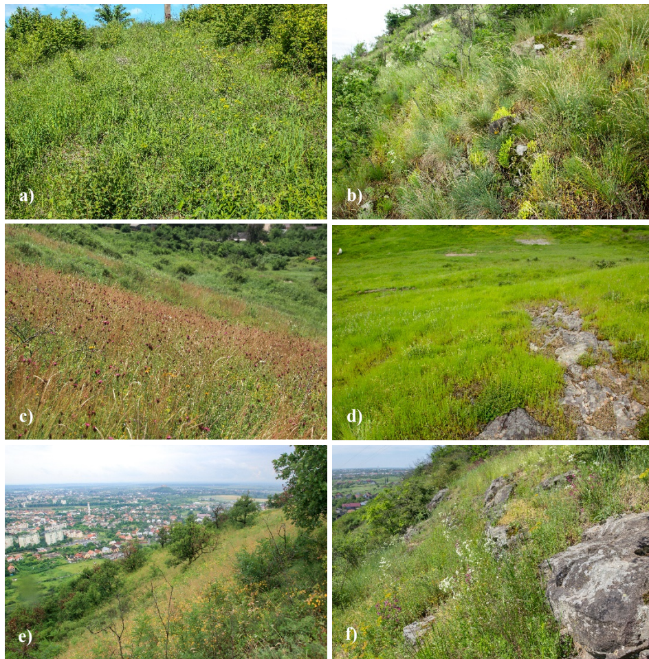
Fig. 3. a) Scabioso ochroleucae-Brachypodietum pinnati near the village of Perechyn in the Upper Uzh River valley; b) Festucetum pseudodalmaticae with tussocks of Festuca pseudodalmatica on Chornahora Hill near Vynohradiv; c) Astero linosyris-Festucetum rupicolae dominated by Dianthus carthusianorum , Festuca stricta subsp. sulcata and Inula ensifolia near the village of Muzhievo in the Berehove area; d) Airo-Vulpietum dominated by Potentilla argentea , Scleranthus annuus and Vulpia myuros with patches of Thymus pannonicus agg. near the village of Veryatsya in the Vynohradiv area; e) Exposure-related forest-steppe on Lovachka Hill above the town of Mukacheve with Festucetum pseudodalmaticae and Airo-Vulpietum ; f) A mosaic of Festucetum pseudodalmaticae grassland and thermophilous scrub near Onokivtsi (Photos: a) M. Chytrý, May 2017; b), d), f) K. Chytrý, May 2017; c), e) K. Chytrý, June 2016).

Abb. 3. a) Scabioso ochroleucae-Brachypodietum pinnati nahe Perechyn im oberen Uzh-Tal); b) Festucetum pseudodalmaticae mit Horsten von Festuca pseudodalmatica auf dem Chornahora-Hügel nahe Vynohradiv; c) Astero linosyris-Festucetum rupicolae mit Dominanz von Dianthus carthusianorum , Festuca stricta subsp. sulcata und Inula ensifolia nahe Muzhievo in der Region Berehove; d) Airo-Vulpietum mit Dominanz von Potentilla argentea , Scleranthus annuus und Vulpia myuros sowie Gruppen von Thymus pannonicus agg. nahe Veryatsya in der Region Vynohradiv; e) Expositionsbedingte Waldsteppe auf dem Lovachka-Hügel oberhalb von Mukacheve mit dem Festucetum pseudodalmaticae und dem Airo-Vulpietum ; f) Mosaik aus dem Festucetum pseudodalmaticae grassland und thermophilen Gebüsch nahe Onokivtsi (Autoren der Fotos s. o.).