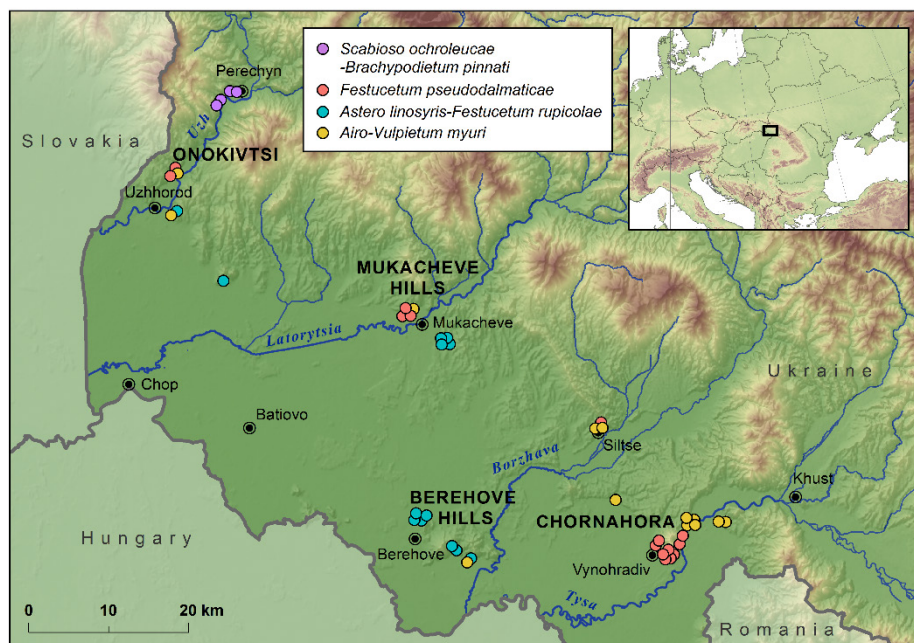
Fig. 1. Map of the Transcarpathian Lowland showing sample plots (relevés) and their classification to associations.

The Transcarpathian (Tysa) Lowland (Fig. 1) occupies the south-western part of the Zakarpattia Region (Oblast) of Ukraine, extending in northwest-southeast direction from the town of Uzhhorod to the town of Vynohradiv. It lies between the western foothills of the Eastern Carpathian Mountains and the state borders of Slovakia, Hungary and Romania. The total area of the Transcarpathian Lowland is about 2,000 km 2 . Being situated on the south-western side of the Eastern Carpathians, its flora and vegetation are biogeographically linked to that of the Pannonian (Carpathian) Basin rather than to the rest of the Ukrainian territory (DIDUKH & SHEL'YAG-SOSONKO 2003). Miocene sediments predominate in the area, being covered by loess at a few sites near its eastern edge. Tertiary volcanic (predominantly andesite, but also dacite and rhyolite; PÉCSKAY et al. 2000) hills rise from the lowland in several places, including Chornahora Hill near Vynohradiv, the Mukacheve Hills and the hill in the village of Siltse. The average altitude of the lowland is between 100 and 120 m a.s.l. It is