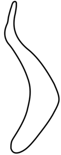
Figs 1, 2: pattern of prothorax: 1 - Aetheomorpha weigeli sp. nov.; 2 - Aetheomorpha jacobyi L. Medvedev