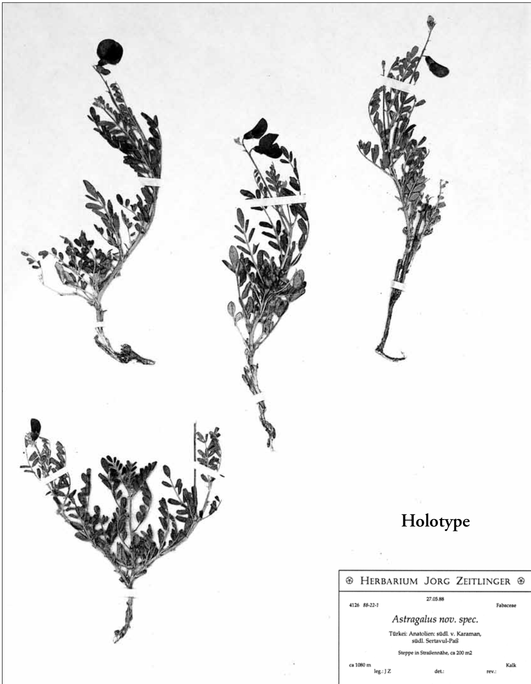
Figure 1: Astragalus friederikeanus : holotype, Zeitlinger 4126, KL.

mucronulate; upper surface green, glabrous or with few scattered white hairs; lower surface white bifurcate-sericeous-strigillose. Peduncles 4–6 cm long, arising mostly from axils of upper leaves, with 4–5 flowers in short racemes of 1.5–2.5 cm. Bracts lanceolate, ~2 mm, acute, adpressed-hairy to ciliate. Bracteoles one per flower, minute ~1 mm. Pedicels 3.5–4 mm long, white-hairy. Calyx unequally 5-dentate, campanulate, 5 mm long including 3 upper teeth, narrowly triangular