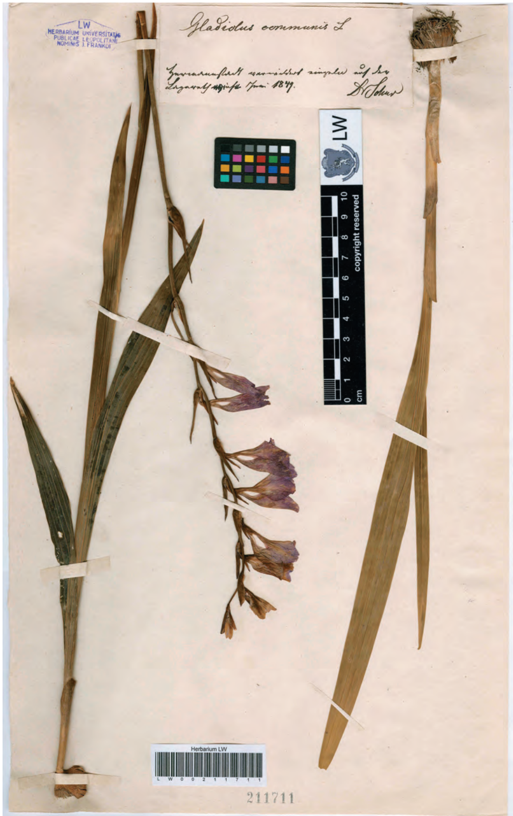
Figure 3. Herbarium sheet of Gladiolus communis L.