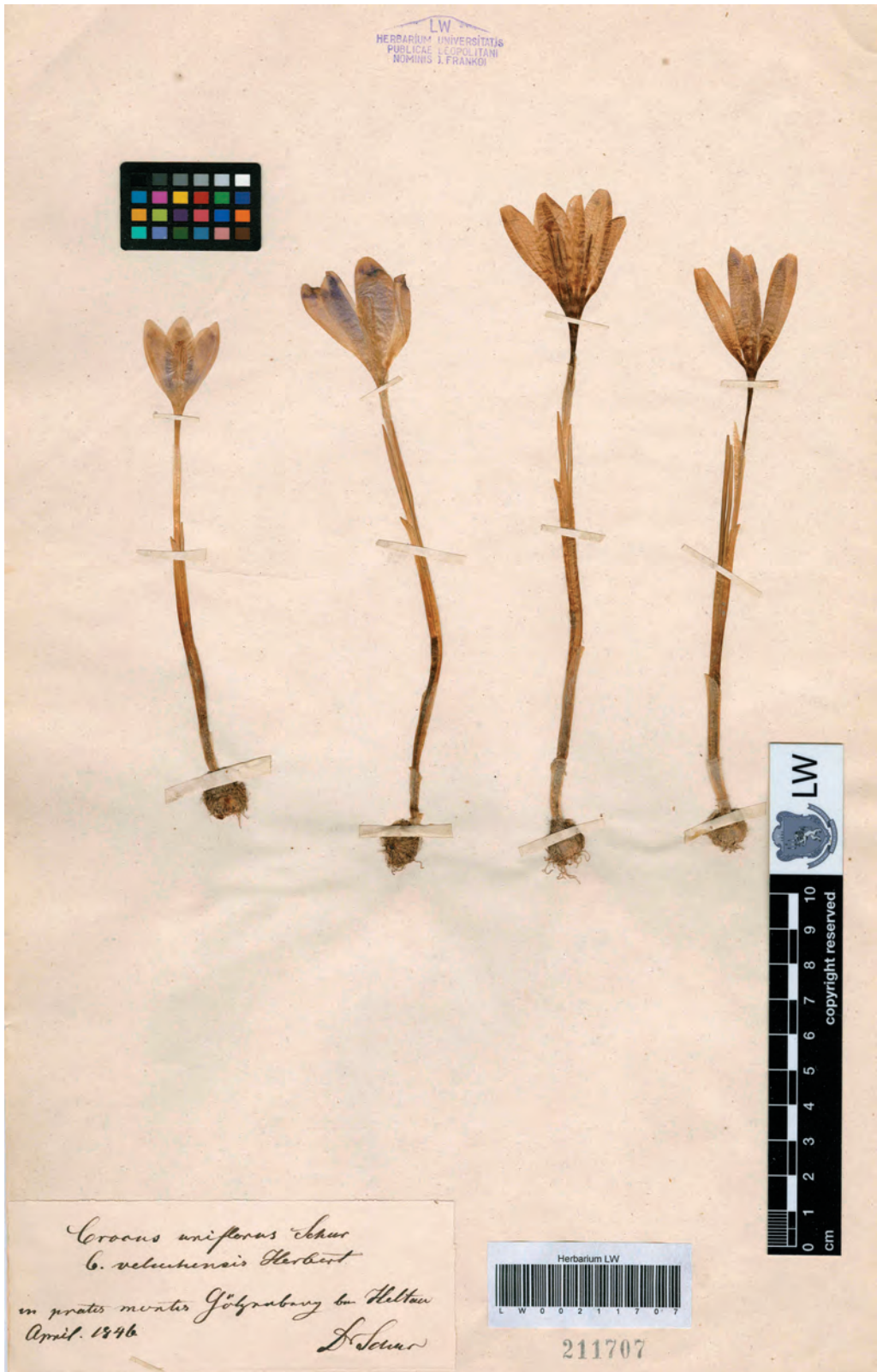
Figure 2. Herbarium sheet of Crocus uniflorus Schur.