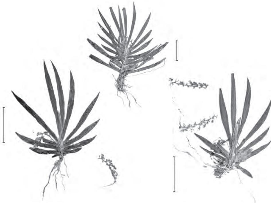
Figure 2. Ornithocephalus leslie-garayi , habit. Scale bars = 3 cm.

Taxonomic notes. O. leslie-garayi is similar to O. caveroi which was collected in southern Peru, in Puno province ca. 1500 km distant from the Colombian border. Both species share a similar lip form which is pandurate with epichile incurved towards the gynostemium, but the two species can be separated based on a series of morphological characters. O. caveroi has flowers about twice larger than in the new species and a different lip callus which consists of an ovoid central part and lateral erect-incurved, oblong calli. The epichile of O. caveroi is covered with hirsute hairs and its sepals and floral bracts are more bristle.