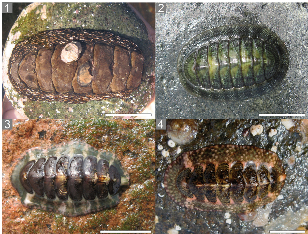
Plate 2. Chiton species photographed in situ; 1. Enoplochiton niger , Isla Playa Ramada, 123 mm; 2. Radsia barnesii , Sur Playa Ramada, 22 mm; 3. Tonicia atrata , Sur de Playa Brava, 30 mm; 4. Tonicia chilensis , Playa Mansa, 32 mm. Scale bars are: 1 cm for 2 and 4, 2 cm for 3 and 4 cm for 1.

central area with numerous uneven longitudinal ribs. Lateral triangle barely raised, with 5–7 irregular nodules. Shell color cream white with reddish brown splotches on central areas, irregular longitudinal dark reddish brown bands on lateral triangles, and occasional dark reddish brown on jugum. Girdle light greenish brown with faint trace of alternating lighter bands in some specimens. Interior of valves white (After Bullock 1988).