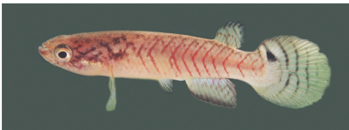
Figure 7. Melanorivulus linearis sp. n., paratype, UFRJ 11679, 23.4 mm SL.