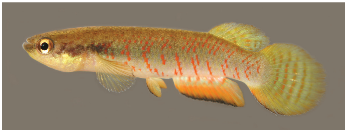
Figure 4. Melanorivulus nigromarginatus sp. n., holotype, UFRJ 8434, male, 27.6 mm SL.