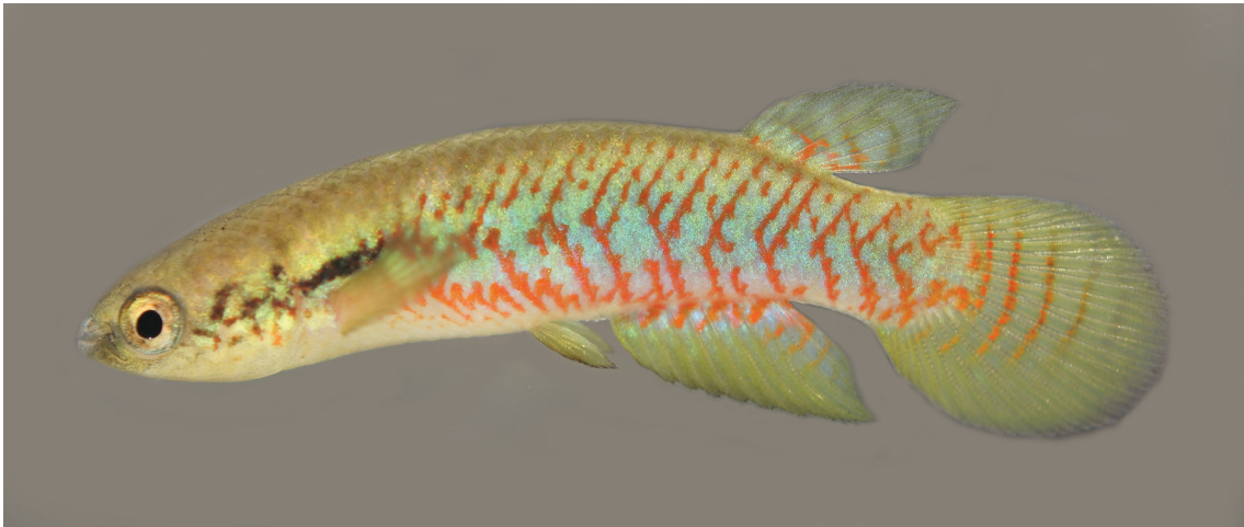
Figure 1. Melanorivulus proximus sp. n., holotype, UFRJ 11681, male, 27.7 mm SL.