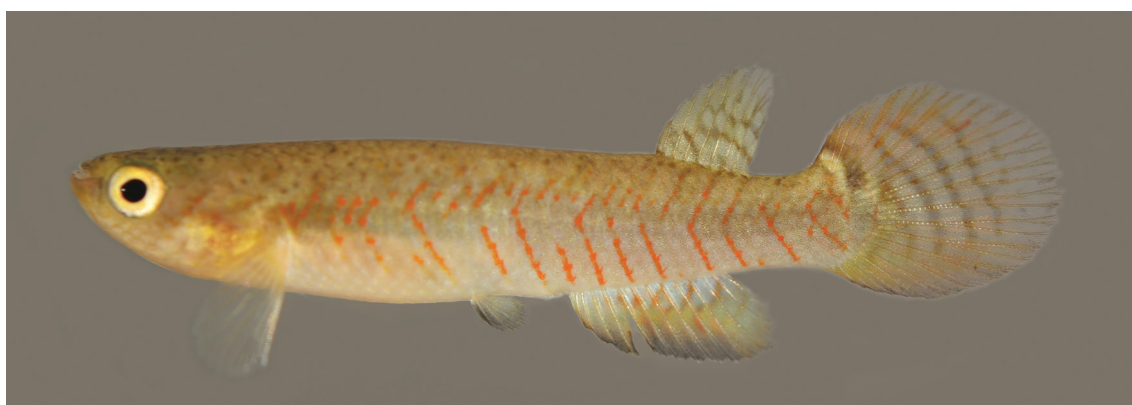
Figure 5. Melanorivulus nigromarginatus sp. n., paratype, UFRJ 8436, female, 23.8 mm SL.