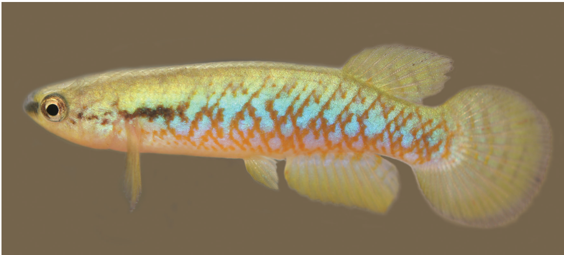
Figure 8. Melanorivulus scalaris , UFRJ 6494, male, 29.7 mm SL.

phometric, meristic and osteological characters among species of the M. pictus group makes colour pattern characters essential source to diagnose species and to estimate their relationships, since molecular data are not still available for most species. Consequently, the new taxa herein described exhibit colour patterns characters that in combination easily allow their recognition as new species, but their relationships are still unclear.