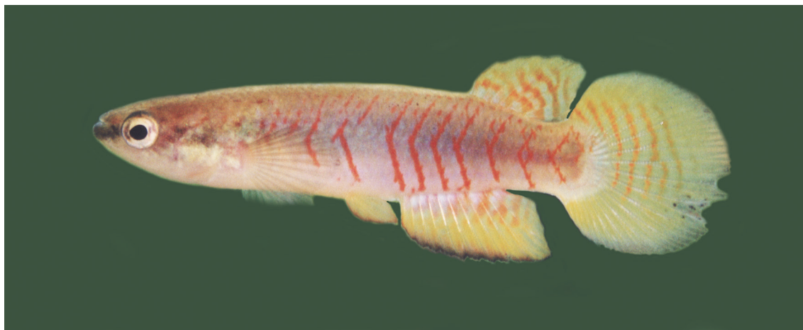
Figure 6. Melanorivulus linearis sp. n., holotype, UFRJ 11678, male, 25.1 mm SL.