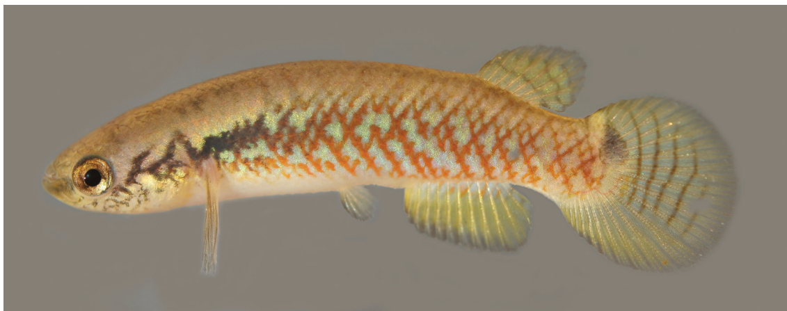
Figure 9. Melanorivulus scalaris , UFRJ 6494, female, 24.2 mm SL.

marks regularly distributed on the flank in males (Fig. 6; Costa 2005: fig. 11).