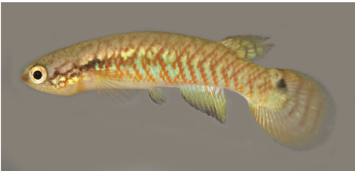
Figure 2. Melanorivulus proximus sp. n., paratype, UFRJ 10792, female, 26.6 mm SL.

Diagnosis. Melanorivulus proximus is distinguished from all other congeners of the M. pictus group except M. scalaris by the presence of irregularly arranged, interconnected oblique red bars on flank, forming Y- and X-shaped marks. Melanorivulus proximus is distinguished from M. scalaris by: caudal fin base colour pale orangish pink in females (vs. pale yellow); dorsal and anal fin sharply pointed in males (vs. rounded to moderately pointed), dorsal-fin origin at vertical between base of 9th and 10th (vs. between base of 7th and 8th); longitudinal series of scales 29–30 (vs. 31–34); pre-dorsal length longer in males (75.9–78.4 % SL vs. 73.0–75.0 % SL); longer anal-fin base (21.1–24.7 % SL in males and 18.8–21.4 % SL in females vs. 18.1–21.0 % SL in males and 16.2–18.5 % SL in females); and fewer infraorbital neuromasts around orbit (9–10 vs. 11–12).