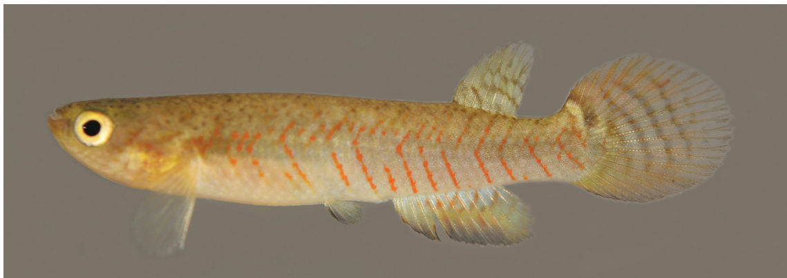
Figure 5. Melanorivulus nigromarginatus sp. n., paratype, UFRJ 8436, female, 23.8 mm SL.