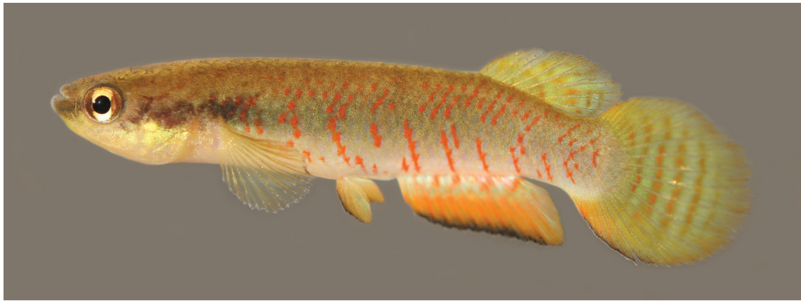
Figure 4. Melanorivulus nigromarginatus sp. n., holotype, UFRJ 8434, male, 27.6 mm SL.