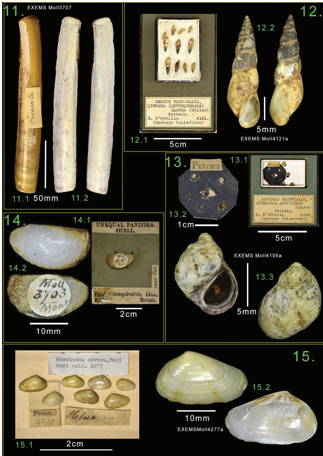
Figures 11–15. 11. Solen novacula Montagu, 1803 [ Ensis siliqua (Linnaeus, 1758)] 11.1 External of right valve of syntype EXEMS Moll3707 with original label. 11.2 Internals of left and right valves of syntype EXEMS Moll3707. 12. Helix octanfracta Montagu, 1803 [ Omphiscola glaber (Müller, 1774)]. 12.1 “Rowley” box with 11 shells, Syntypes, EXEMS Moll4121. 12.2 Apertural and abapertural views of a single syntype, EXEMS Moll4121a. 13. Helix patraea Montagu, 1803 [ Melarhaphé neritoides (Linnaeus, 1758)]. 13.1 “Rowley” box with card and 6 shells, Syntypes, EXEMS Moll4185. 13.2 Montagu hexagonal blue card with printed label. 13.3 Apertural and abapertural views of syntype EXEMS Moll4195a. 14. Solen pinna Montagu, 1803 [ Pandora pinna (Montagu, 1803)]. 14.1 Green coloured wooden mount with single Montagu specimens attached. 14.2 Exterior of right and left valves of EXEMS Moll3703, possible syntype. 15. Donax plebeia Montagu, 1803 [ Donacilla cornea (Poli, 1791)]. 15.1 Original label and 7 shells all syntypes EXEMS Moll4277. 15.2 Internal and external views of a single right valve, EXEMS Moll4277a.