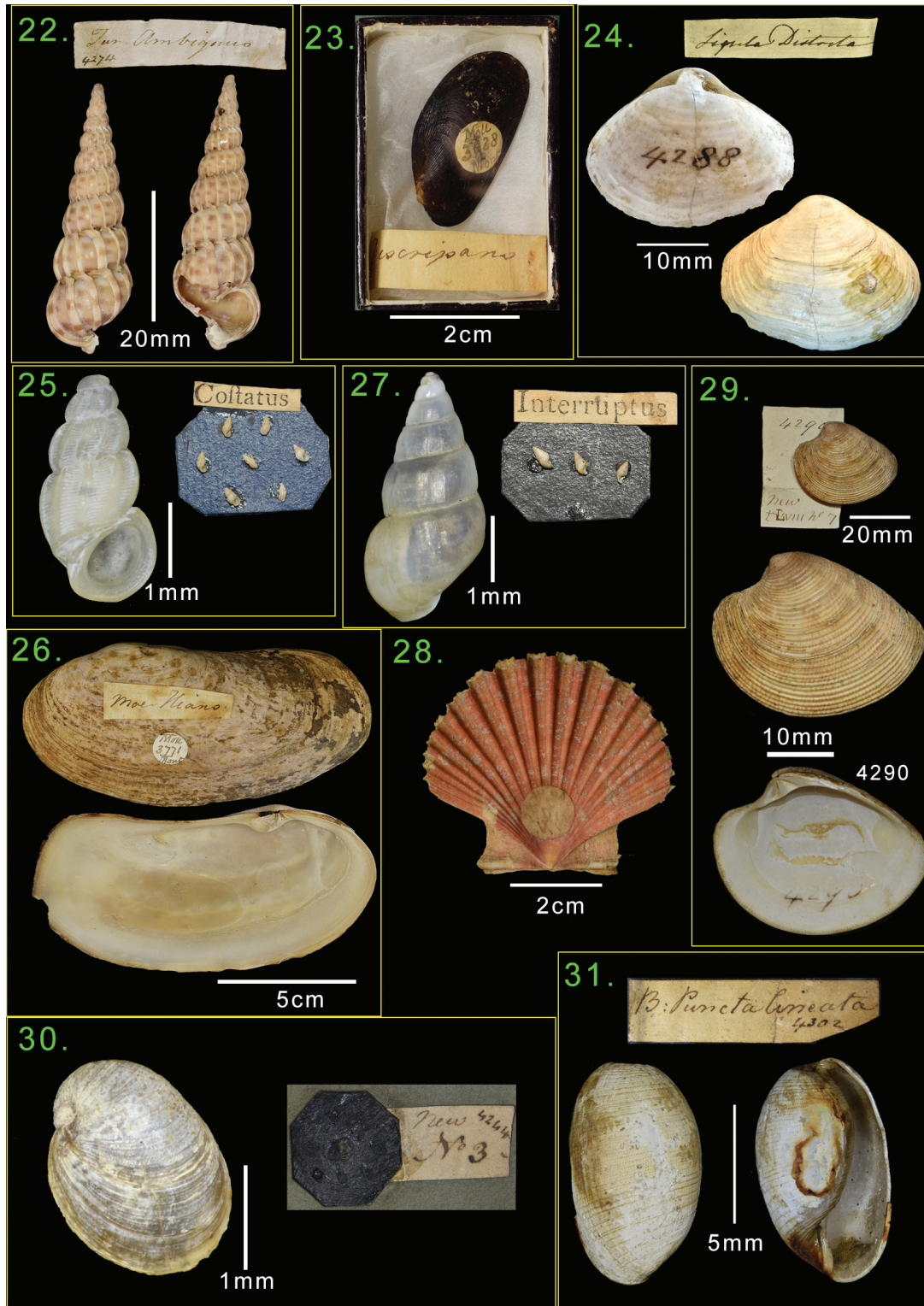
Figures 22–31. 22. Turbo ambiguus sensu Montagu ms [ Epitonium turtonis (Turton, 1819)] Label, abapertural and apertural views of EXEMS Moll4274. 23. Mytilus discrepans sensu Montagu 1808 [ Musculus niger (Gray, 1824)] Exterior of left valve in box with original label EXEMS Moll3938. 24. Ligula distorta Montagu, 1808 [ Thracia convexa (Wood, 1815)], Label, interior and exterior of single right valve, EXEMS Moll4288. 25. Turbo costatus Adams, 1797 [ Manzonina crassa (Kanmacher, 1798)] Montagu hexagonal blue card mount with 7 shells, furthest right is Rissoia parva ; one enlarged, apertural view, EXEMS Moll4212. 26. Mactra hians Pulteney, 1799 [ Lutraria oblonga (Gmelin, 1791)], external and internal views of a left valve, EXEMS Moll3771. 27. Turbo interruptus Adams, 1800 [ Rissoia parva (da Costa, 1778)], Montagu black card mount with 3 shells, one enlarged abapertural view, EXEMS Moll4224. 28. Montagu's specimens of Pecten jacobaeus (Linnaeus, 1758) EXEMS Moll4000. 29. Venus lammosa Montagu, 1808 [ Chamelea striatula (da Costata, 1778)], EXEMS Moll4290. 30. Otina ovata (Brown, 1827) Montagu's mount and 1 remaining shells of his "new No 3". 31. Bulla punctalineata Montagu ms [ Roxania utriculus (Brocchi, 1814)], EXEMS Moll4302.