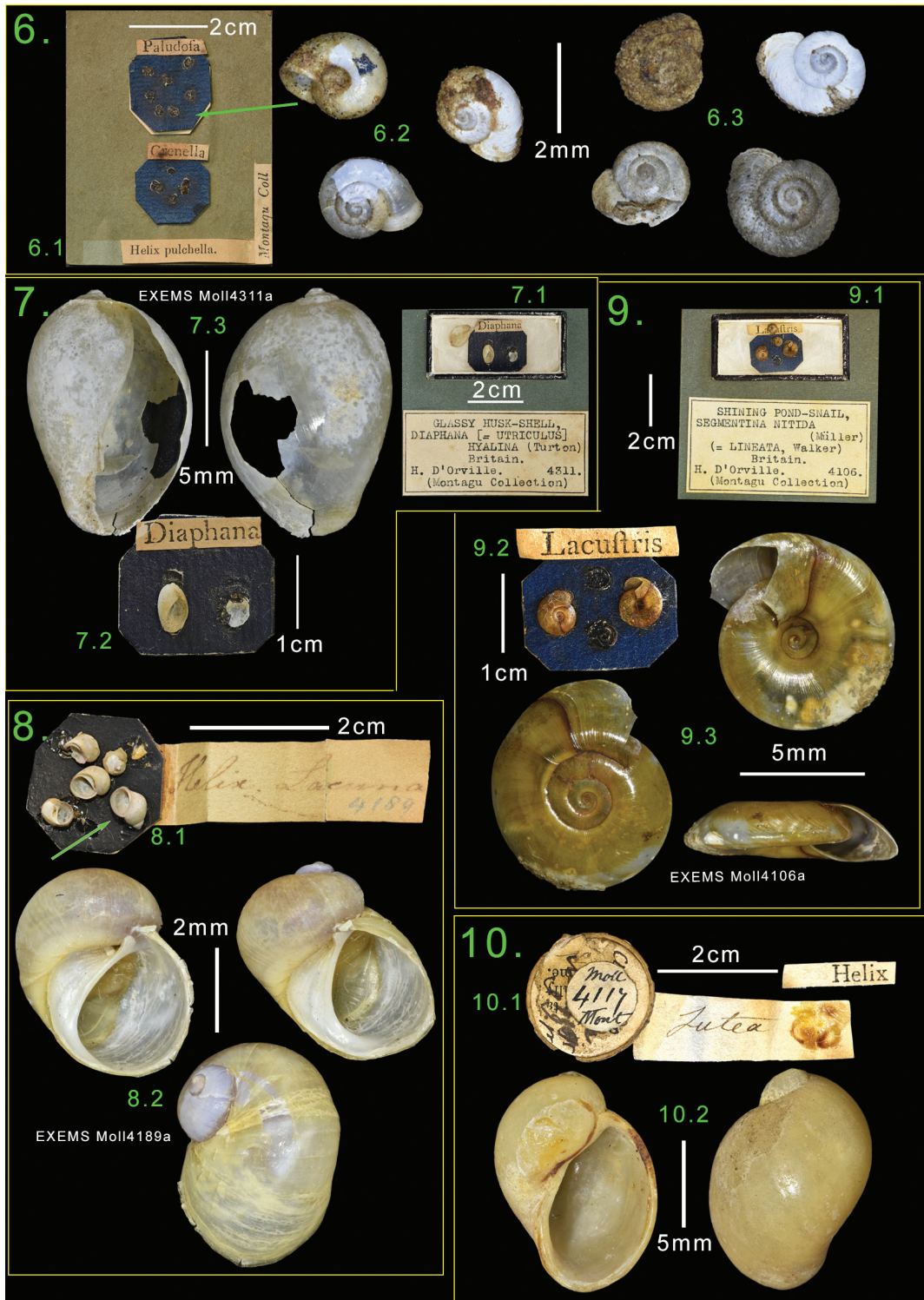
Figures 6–10. 6. Vallonia spp. 6.1 Mount with two Montagu blue hexagonal cards for Helix crenella Montagu, 1803 (EXEMS Moll4149) and Helix paludosa da Costa, 1778 (EXEMS Moll4148), no shells attached. 6.2 3 shells identified as Vallonia excentrica Sterki, 1893, one can be associated with paludosa card (arrowed). 6.3 4 shells tentatively identified as Vallonia costata (Müller, 1774). 7. Bulla diaphana Montagu, 1803 [ Trivia arctica (Pulteney, 1799)]. 7.1 “Rowley” box for lot 4311 with 2 shells, Syntypes. 7.2 Montagu hexagonal blue card mount with 1 shell attached. 7.3 Apertural and abapertural views of largest but damaged syntype, EXEMS Moll4311a. 8. Helix lacuna Montagu, 1803 [ Lacuna parva (da Costa, 1778)]. 8.1 Montagu black hexagonal card mount with 5 shells, bottom right (arrowed) is Lacuna vincia . 8.2 basal, apertural and abapertural view of 1 of 4 syntypes, EXEMS Moll4189. 9. Nautilus lacustris Montagu, 1803 [ Segmentina nitida (Müller, 1774)]. 9.1 “Rowley” box with blue card and 4 shells, Syntypes, EXEMS Moll4106. 9.2 Montagu blue hexagonal card mount and printed label. 9.3 apical, basal and lateral views of syntype EXEMS Moll4106a. 10. Helix lutea Montagu, 1803 [ Radix bathica (Linnaeus, 1758)]. 10.1 Old box and original hand-written label for lot 4117. 10.2 Apertural and abapertural views of unique syntype EXEMS Moll4117.