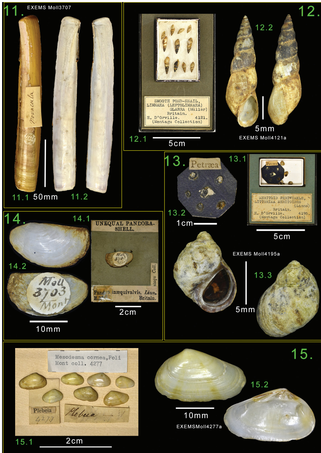
Figures 11–15. 11. Solen novacula Montagu, 1803 [ Ensis siliqua (Linnaeus, 1758)] 11.1 External of right valve of syntype EXEMS Moll3707 with original label. 11.2 Internals of left and right valves of syntype EXEMS Moll3707. 12. Helix octanfracta Montagu, 1803 [ Omphiscola glaber (Müller, 1774)]. 12.1 “Rowley” box with 11 shells, Syntypes, EXEMS Moll4121. 12.2 Apertural and abapertural views of a single syntype, EXEMS Moll4121a. 13. Helix patraea Montagu, 1803 [ Melarhapha neritoides (Linnaeus, 1758)]. 13.1 “Rowley” box with card and 6 shells, Syntypes, EXEMS Moll4185. 13.2 Montagu hexagonal blue card with printed label. 13.3 Apertural and abapertural views of syntype EXEMS Moll4195a. 14. Solen pinna Montagu, 1803 [ Pandora pinna (Montagu, 1803)]. 14.1 Green coloured wooden mount with single Montagu specimens attached. 14.2 Exterior of right and left valves of EXEMS Moll3703, possible syntype. 15. Donax plebeia Montagu, 1803 [ Donacilla cornea (Poli, 1791)]. 15.1 Original label and 7 shells all syntypes EXEMS Moll4277. 15.2 Internal and external views of a single right valve, EXEMS Moll4277a.