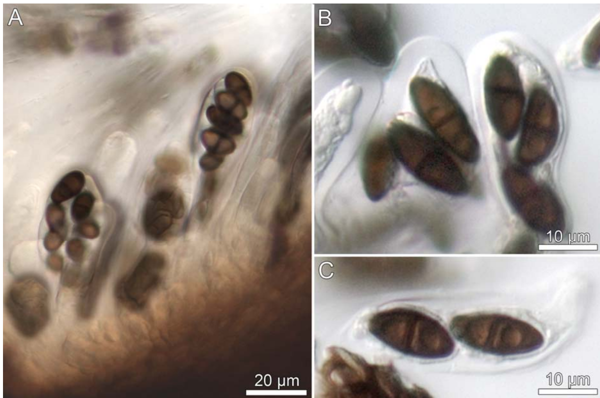
Figure 2: Endococcus freyi (holotype; medium: tap water). – A ) Part of ascatal cavity with mature asci. – B ) Ascus tips of mature asci. – C ) Ascospores. – Photos: Walter Obermayer.

Hosts: Umbilicaria cylindrica (thallus) (1, T), Umbilicaria crustulosa coll. (thallus) (2)