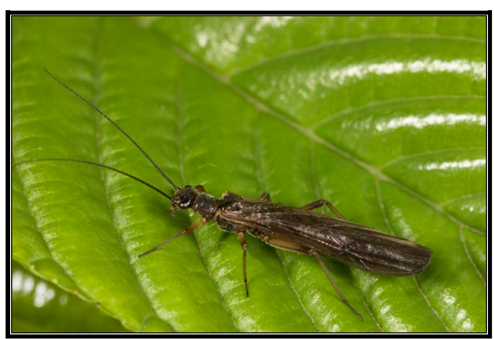
One of the species collected, Protonemura auberti Illies