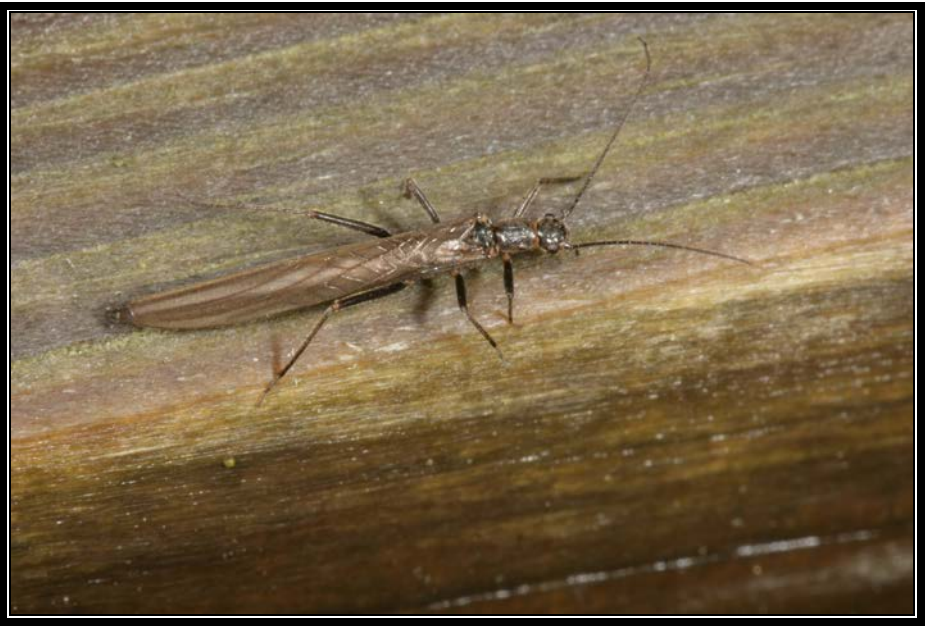
One of the species collected, Leuctra fusca (L.), Photograph by Ignac Sivec.