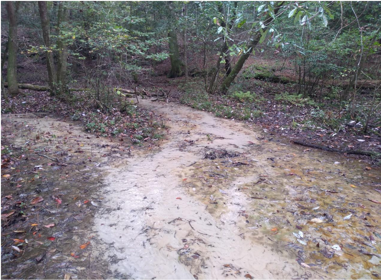
Schoolhouse Springs, looking upstream toward seepage sources.