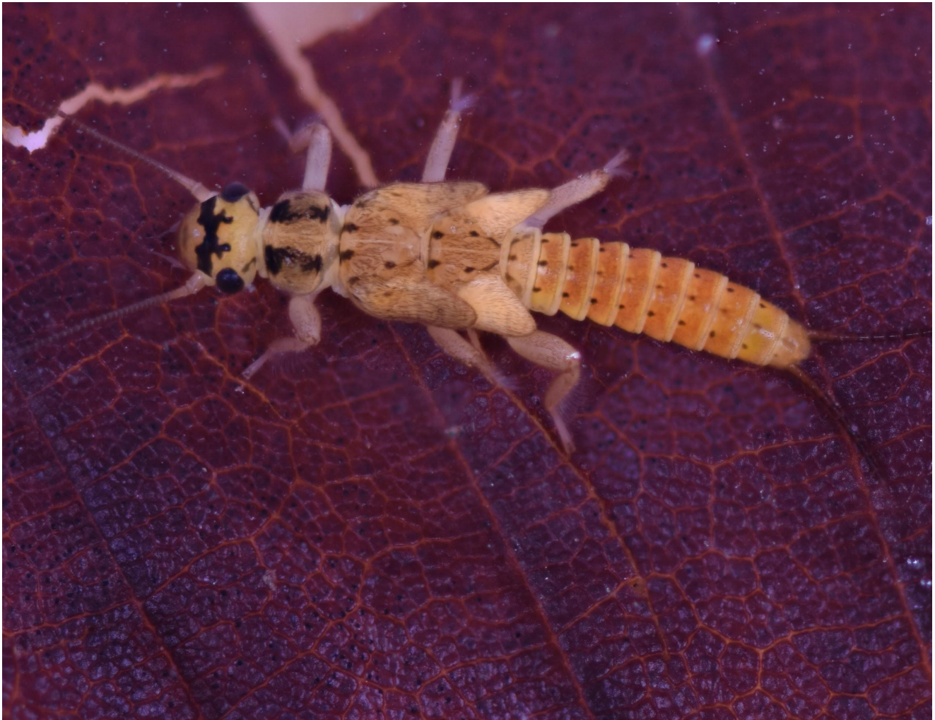
Nymphal habitus of Isoperla “Mayo River”.