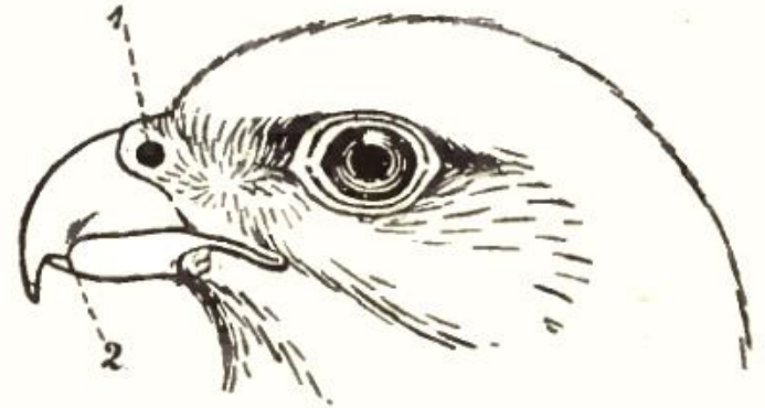
Head of a Falcon ( Hierofalco islandus ) to show impervious nostrils, and tooth-like process of the bill.