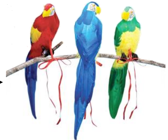
Parrots and Passerines