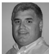
G.R. Cardillo Enterprise Products