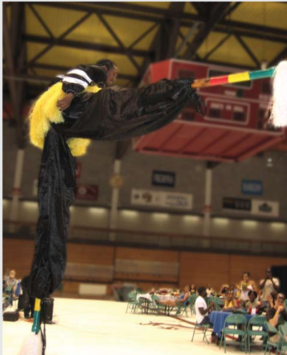
During 2007-08, The Cortland Fund made it possible for the campus community to experience the uniquely Caribbean sight of a leggy Moko Jumbie showing off his amazing stiltwalking ability, during the College’s CaribExpo held during April in the Park Center Alumni Arena.