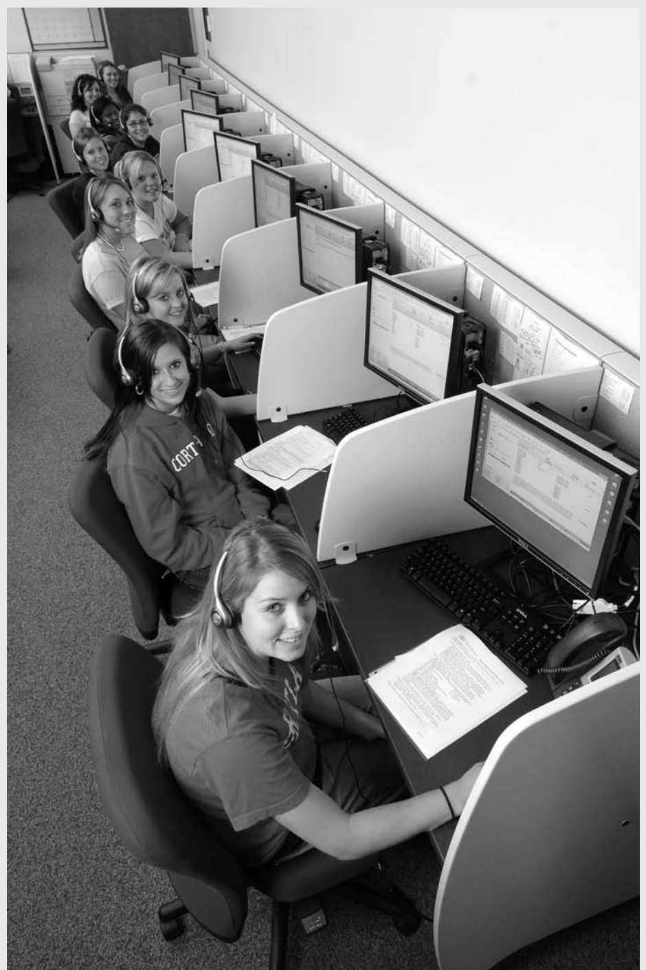
SUNY Cortland Dragon Dialers begin their shift in the Call Center located in Brockway Hall.

During the 2007-08 fiscal year, Call Center gifts totaled $236,460. The funds are used for student scholarships, academic program support, international programs, civic engagement and learning activities, cultural arts programming, technology enhancements and faculty research and development.