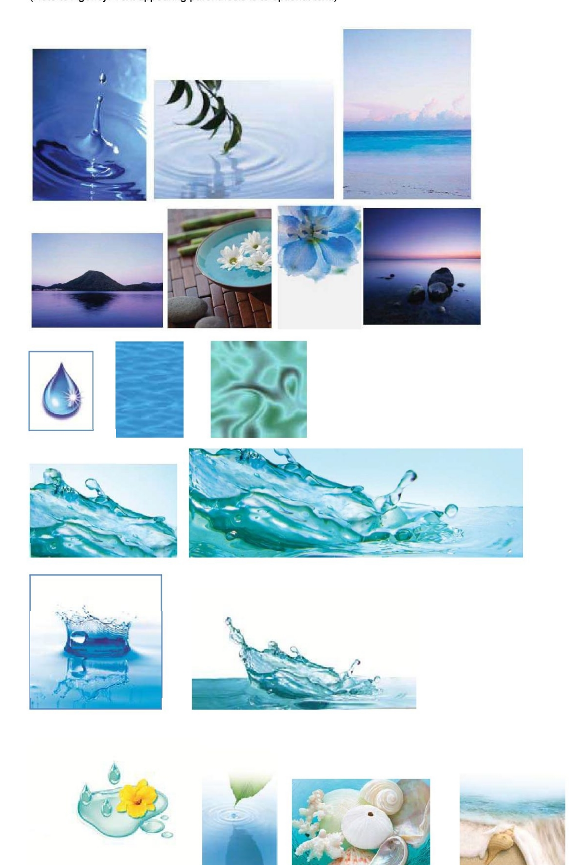
S.C. Johnson & Son, Inc.