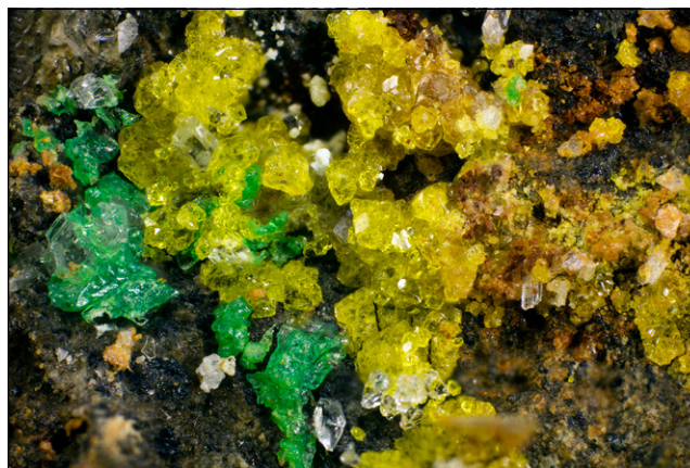
Figure 2. Golden-yellow crystals of ewingite on top of massive uraninite, with transparent gypsum, and green crystals of an unnamed Ca-Cu uranyl carbonate. From the Plavno mine (Vladimir shaft), second level (Jáchymov ore district, western Bohemia, Czech Republic). Horizontal field of view is 2.5 mm.

The uranyl carbonate cage in ewingite contains three fundamental building units (FBUs)