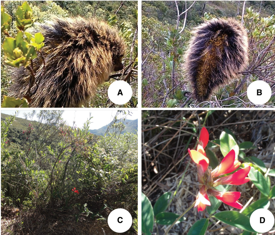
Figure 2: Coendou spinosus on a shrub next to the feeding site (A and B); Camptosema scarlatinum flourishing in the high altitude grassland of the Itatiaia National Park (C); and Camptosema scarlatinum flower (D).

use the forest patches that are immersed in the grassland matrix or, because of high altitude, even change the food items preferences during winter, as occurs with Erethizon dorsatum at high latitudes (Roze 2012). To answer these questions we need the development of systematic studies regarding habitat use, diet and food resources availability for C. spinosus . Considering that other species of the South American porcupines (e.g. C. subspinosus ) are highly selective in terms of species consumed (e.g. Giné et al. 2010) we also need studies about the plant-animal interaction in order to understand ecological needs and interspecific interactions of the Coendou species.