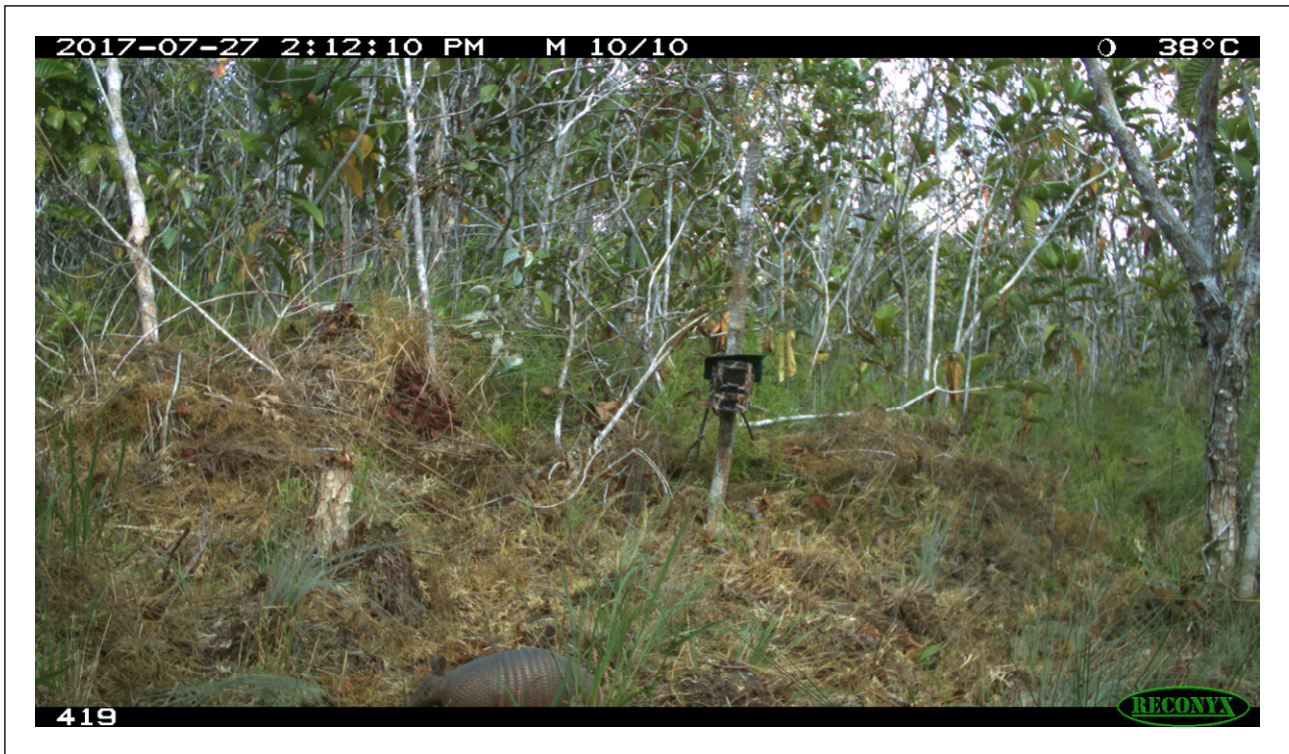
FIGURE 3. Camera trap record of the seven-banded armadillo ( Dasypus septemcinctus ) in the Pampas del Heath, Madidi National Park and Natural Area of Integrated Management, Bolivia.

(Abba et al. , 2014; Anacleto et al. , 2014) and Data Deficient (DD) at the national scale (Tarifa & Aguirre, 2009).