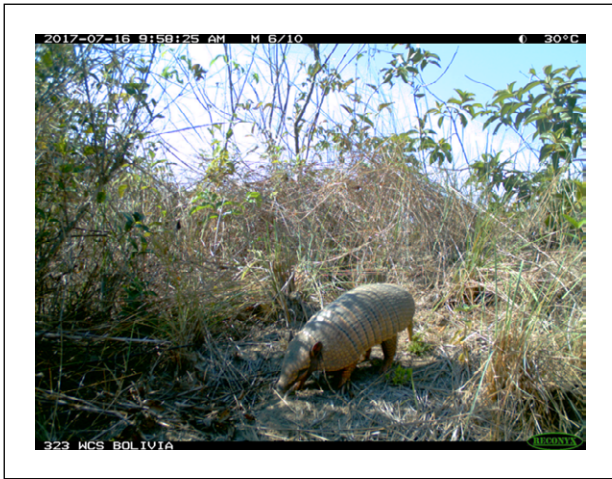
FIGURE 2. Camera trap record of the six-banded armadillo ( Euphractus sexcinctus ) in the Pampas del Heath, Madidi National Park and Natural Area of Integrated Management, Bolivia.

The study was conducted in the Heath basin in the Madidi National Park and Natural Area of Integrated Management (Madidi NP NAIM). The site has a slight altitudinal gradient of 194 to 222 m asl. The main camp was located in Puerto Moscoso (13°0'59.33"S, 68°51'7.14"W), a three-day boat ride from Puerto Chive. The survey was conducted from 20 June to 17 July 2017.