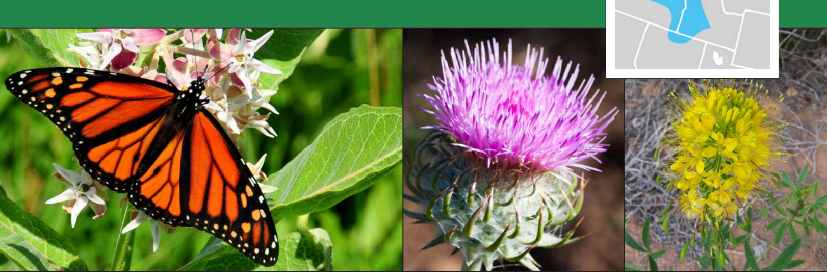
Left to right: Monarch on showy milkweed, cobwebby thistle, and yellow spiderflower.

The Inland Northwest encompasses much of eastern Oregon and Washington stretching from the eastern slopes of the Cascades into parts of western Idaho and northern Nevada. The landscapes in this region are dominated by shrub steppe and open prairie interspersed with juniper woodlands and pine forests. Nectar-rich shrubs and forbs take on special importance in this often arid landscape and are critically important resources for a number of insects and other wildlife, including breeding and migrating monarch butterflies.