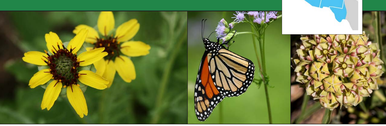
Left to right: Lyreleaf greeneyes, monarch on blue mistflower, and spider milkweed.

The Southwest is a land of geological wonders and climatic extremes. Covering the bulk of Arizona and New Mexico, as well as sections of California, Nevada, Utah, Colorado, and Texas, the southwest region boasts surprisingly lush riparian zones, high deserts, extensive sand dunes, wild cactus gardens, and isolated mountain ranges. Precipitation is minimal except during the summer monsoon season, when violent rainstorms can strike the region. The incredible diversity of landscapes and plant communities has contributed to highly diverse pollinator assemblages, from the hummingbird-sized sphinx moth to the brightly colored milkweed butterflies—the monarchs, queens, and soldiers.